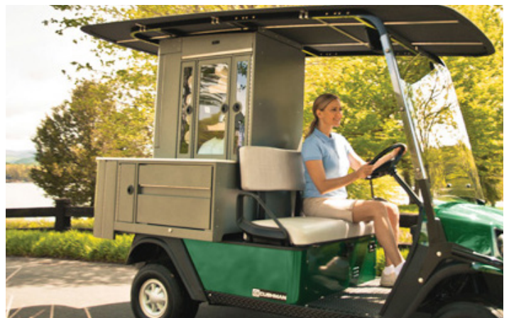
*Not actual beverage cart for sale - stock photo.

2014 Cushman Beverage Cart/Refresher for Sale. $18,000 or best written offer. Jay Druhan 708-473-8706. Palos Hills Golf Course.