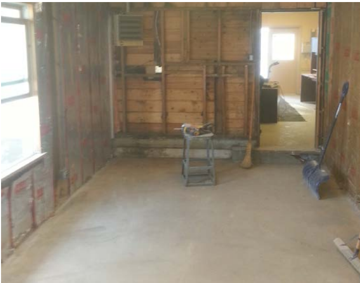
Removing wall paper is easiest when you take out the wall board that it is glued to.