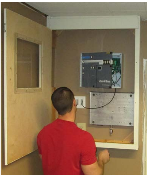
Jason re-installed the irrigation controls into a custom built housing that will neatly hide all the wiring.

Dan is a handy guy to have around because he was able to scale back the size of the cabinet housing or irrigation system components. Jason reinstalled the Rain Bird Maxi Interface Module (MIM), grounding, radio transmitter and all