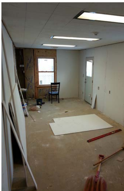
The new dryewall took a day to hang.

The new ½" drywall went in next. Thankfully Dan Clark had a lot of experience installing drywall. He and Jason completed it all in a little more than a day. Thanks to one of the many 'dustings' of snow we had in December it took longer than anticipated. No big whoop. After the drywall went up Jason put drywall joint compound on all the seams and fasteners and let it dry overnight. The following morning the compound was sanded smooth. New outlets were installed all around the room to accommodate all the devices we use every day.