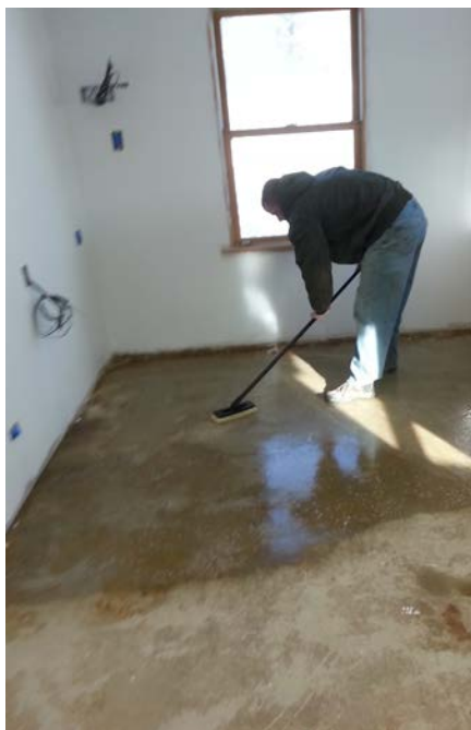
Etching the bare concrete floor ensures that it is clean and good adhesion for paint.

After the floor grinder went back to Rental Max two coats of primer were added to the dry wall. Jason then etched the concrete floor with a dilution of muriatic acid and water. It's important to have good ventilation during this process. This is a lesson I learned the hard way. After the floor was etched it was time to paint the drywall.