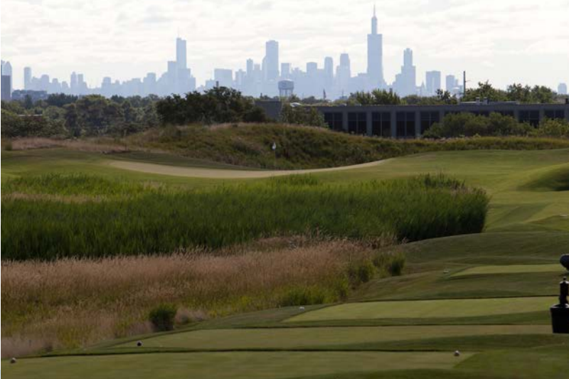
Image Below: The third hole in the foreground and the 8th in the background uses native plantings to separate playing areas and keep the vistas open and spacious.

Image right: One of the most recgonizeable skylines in the world can be seen from several points on the property.