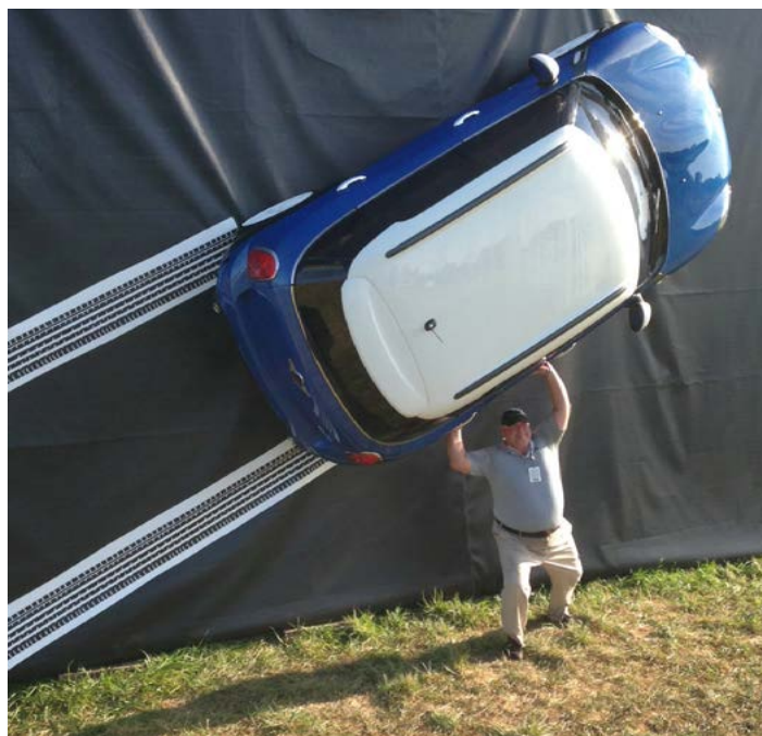
Any other guy and you’d say this was trick photography, but THIS guy is special!