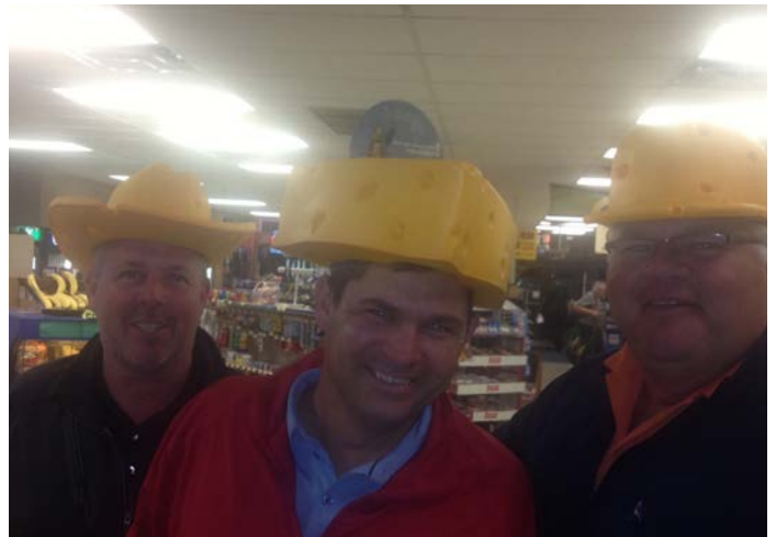
Not cool. Really. Not cool.