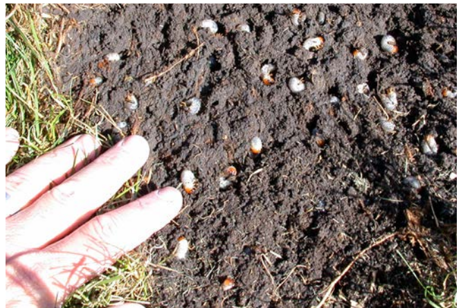
Some applications for grub control missed the mark this year.

of the new chemistry, disease control products and wasn’t impressed.”