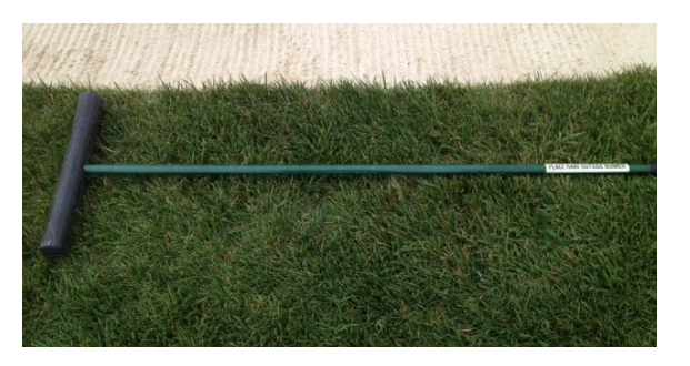
165 Accuform rakes, refurbished in 2013 and used just two months. 54" green handles with 15" heads. All have "Place Rake Outside Bunker" decal on handle. Asking $50/dozen.

From Dan Dinelli, CGCS , who recently participated in GCSAA's Government Relations quarterly meeting, as diligently as GCSAA and others are trying to keep methyl bromide's use for turf on the label (until stock is exhausted), it is not looking rosy. The deadline has not been met yet, but it is looming at year's