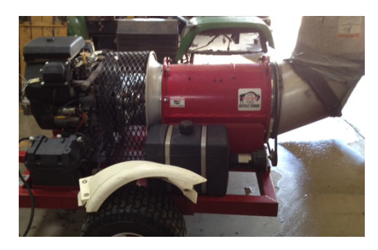
2003 Buffalo Turbine tow-behind blower--$750 OBO

Contact Brian at Bryn Mawr CC at (847) 677-4112.