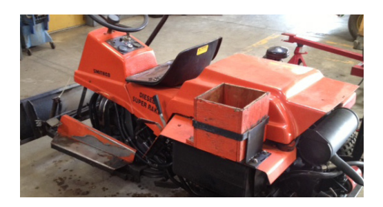
1990 Smithco Bunker Rake. Runs good--$500 OBO