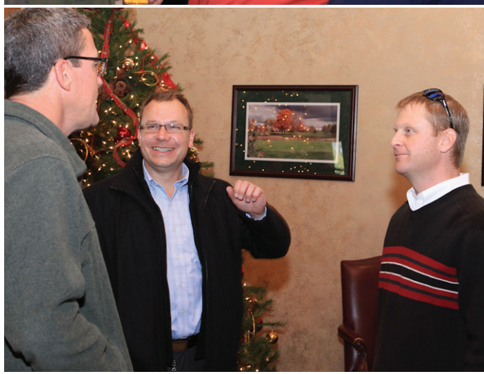
(continued on page 21)