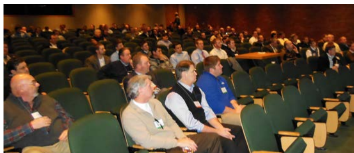
The facility—very comfortable