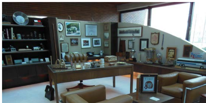
Ray Kroc's office was a neat bit of trivia just inside the entrance