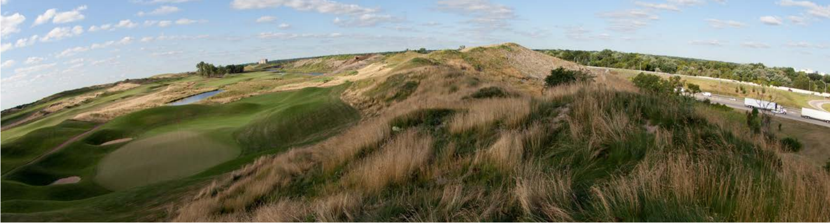
MAGCS will visit Chicago Highlands in October, Chicago's newest golf course bordered by I-294 to the west. However, you don't even know it because of the extensive berms that block all views of the roadway and suprisingly most of the noise.

advancements in society have come from individuals and organizations that all obtained extensive knowledge through education or training....Mandela's quote has taught me that education is the method to obtain knowledge. Knowledge that is obtained and applied by a person has great potential to have monumental impacts on society as a whole."