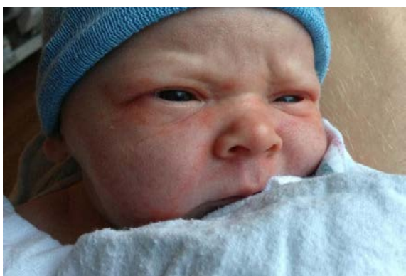
"Poopy diaper! change me dammit!"