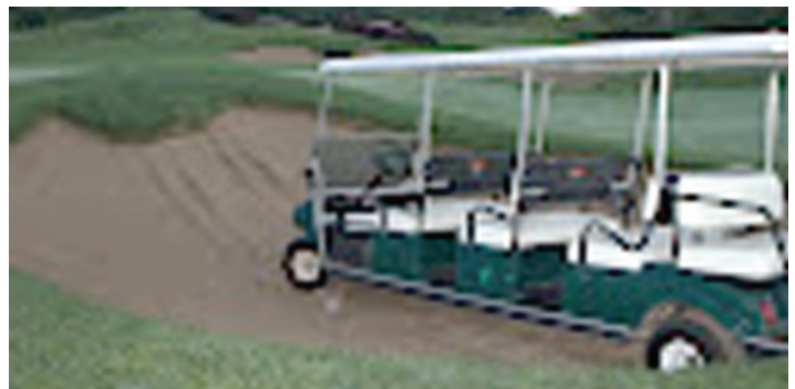
Double oopsy daisy

Pat Jones of GCI magazine may have found the ultimate golf course hazard with this photo: