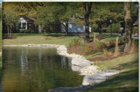
Stream & Pond Bank Restoration and Stabilization