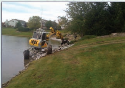
Low Impact Construction Methods