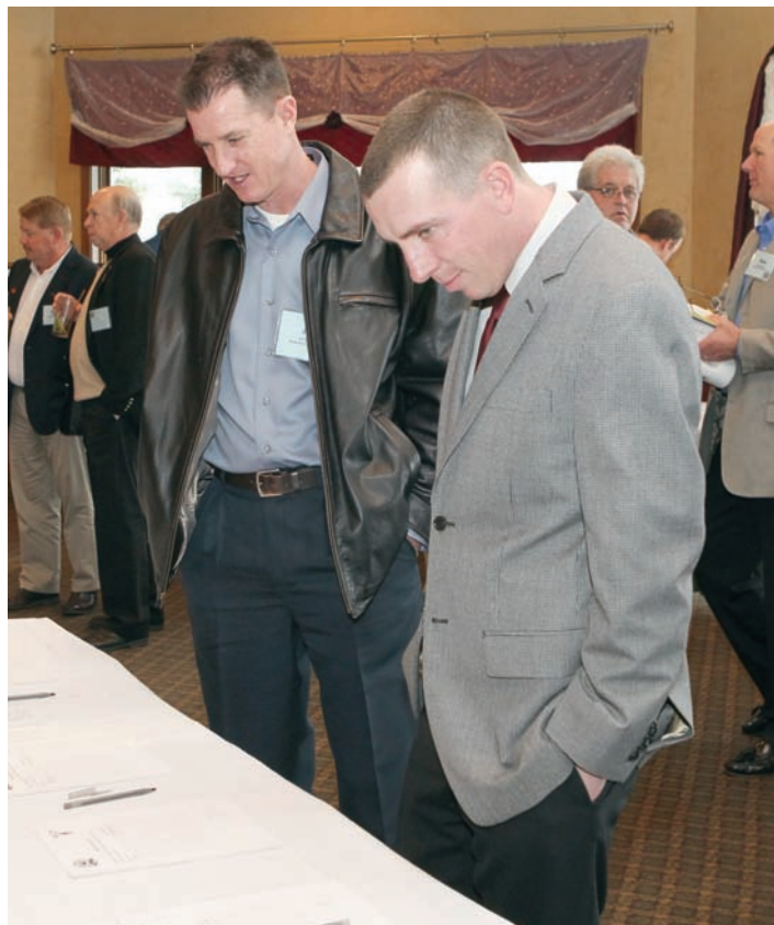
(more photos on page 20)