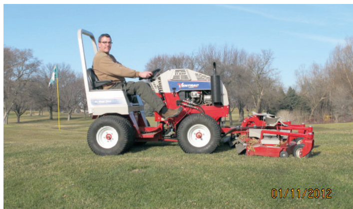
(continued on next page)

Correction: Winter DID make a brief appearance after all—note the date stamps at the lower right of each photo. From a sunny 54-degree day on the 11 th (a mower demo in January?!?) to something a little more seasonal on the 12 th , this has surely been one whacky winter.