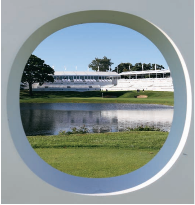
From the O in Joy, the 18th green of Dubsread during set up on Thursday morning.