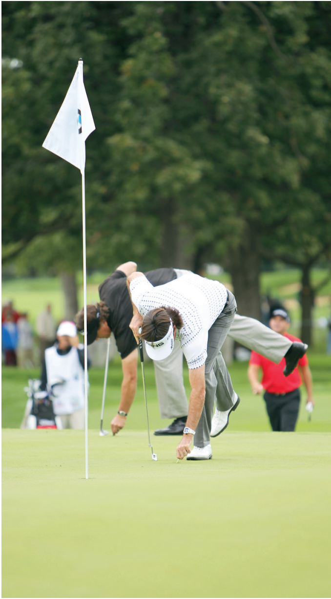
Why don't they ever televise the Pro's doing the ball mark fix pirouette?