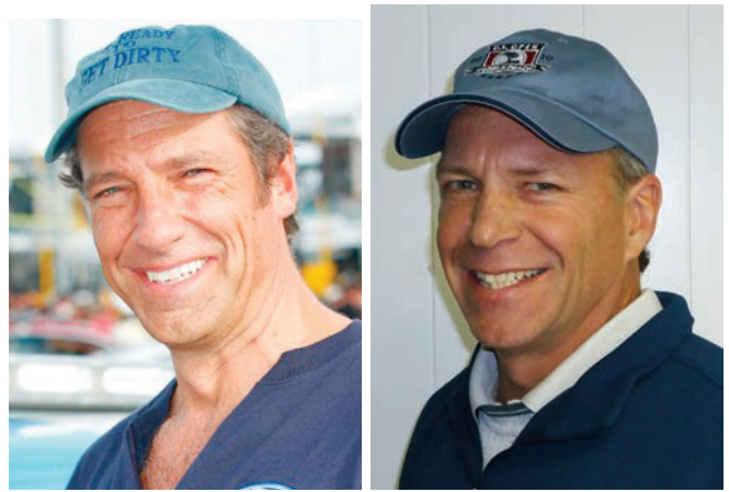
That's one busy guy.