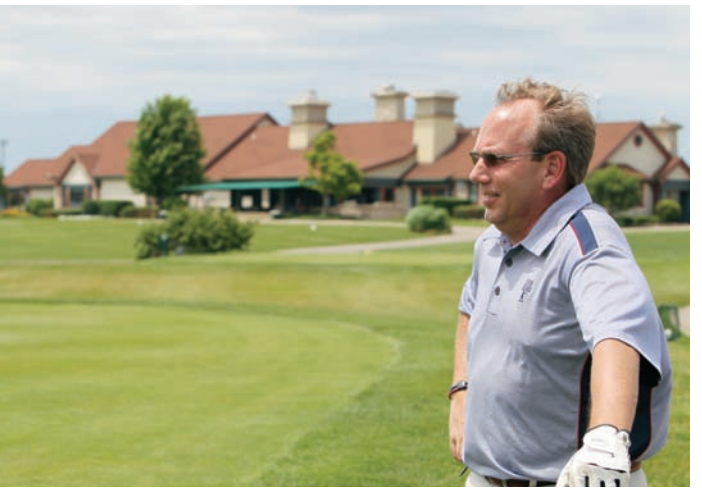
(continued on page 24)