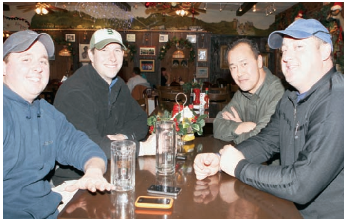
These party crashers skipped the meat platters at the Bier Stube claiming their diets wouldn't allow them to eat the fare.