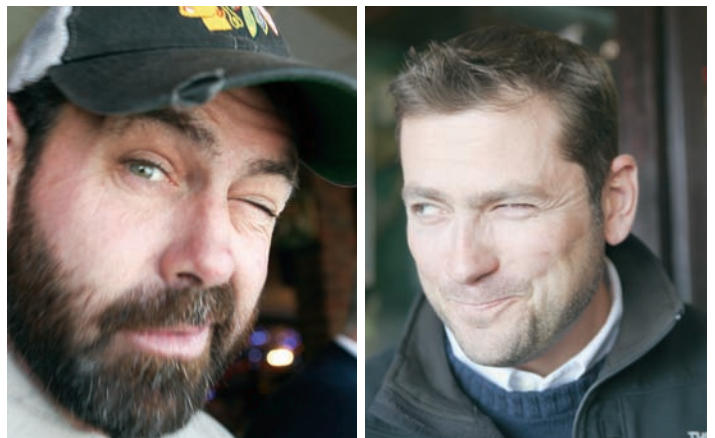
What's with all the winking?