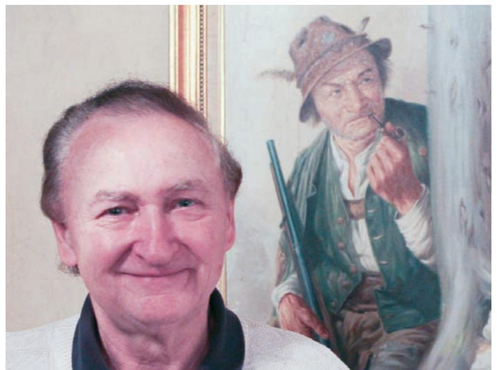
Ancient cave drawing of Vence Zolman found on the dining room wall of Die Bier Stube.