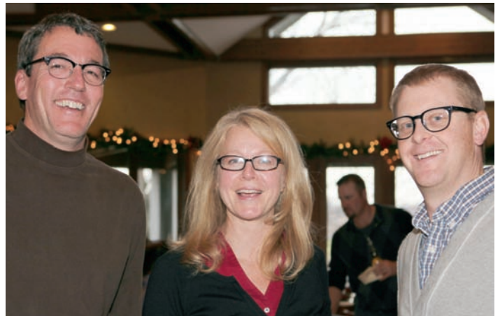
Which one of the above doesn't really need glasses?