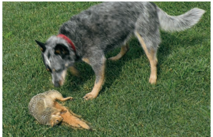
C'mon, wake up! I was just playing!