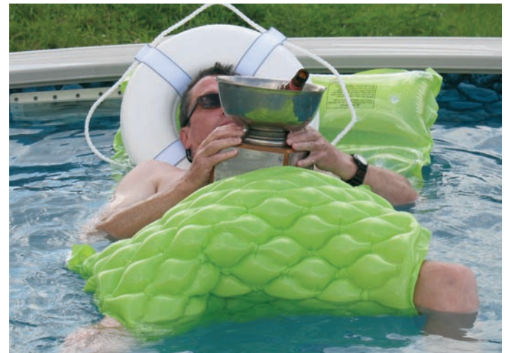
"I just want to know what it feels to be a Blackhawk," Gurke pool hopping with the Grotti. -OC