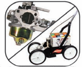
Engine Parts/Marking Tools