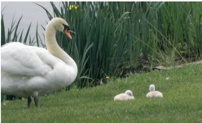
The other adult was biting my leg while this was taken