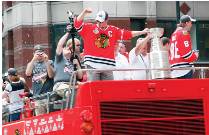
Jonathan Toews and Patrick Kane show off Lord Stanley's Cup during the victory rally

Let's us just get this out of the way right now. The Stanley Cup is alive and well and residing in Chicago! Congratulations to the Chicago Blackhawks on winning the most difficult trophy to win in all of sport.