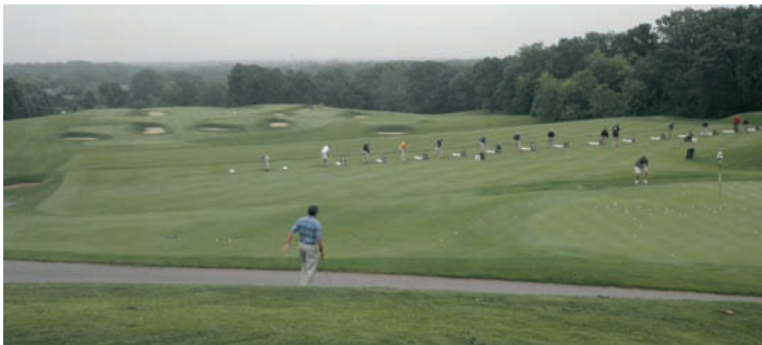
Coollest range ever