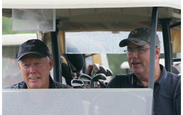
The golf car that will be raffled off at the Midwest Turf Clinic to benefit the Wee One Foundation was on hand, thanks to Nadler Golf Car Sales.