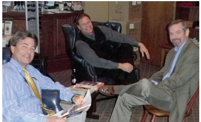
Three captains of industry: Captain Crunch, Captain Morgan and Captain Kangaroo.