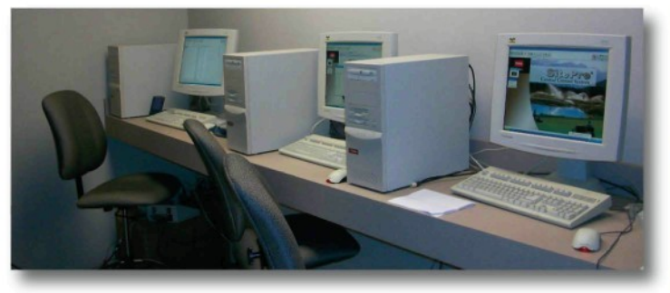
The irrigation computer room for all three courses