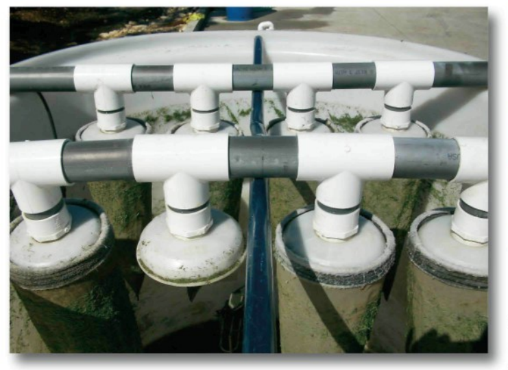
The filter socks inside each drum

The cold storage building was demolished and rebuilt at 20,000 square feet in order to accommodate the equipment fleet. Again, it is in the same location as the former storage building. Expanding the original space proved effective and a much better option than moving the entire facility.