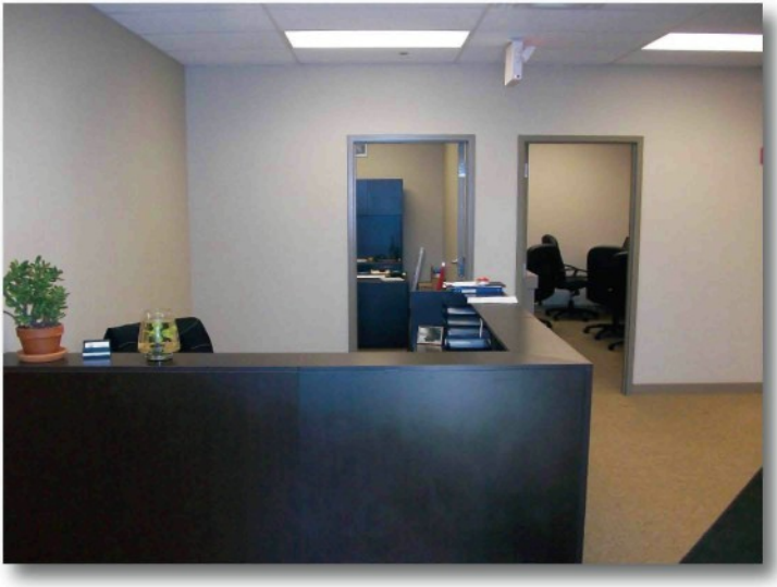
The reception area for Medinah's Turf Care Center

The office space for Curtis' staff also fit inside the footprint of the former maintenance facility and its storage space. The improvements include a professional style reception area, offices for each course superintendent, one room dedicated to irrigation central computers for all three courses, and a conference room for team meetings.