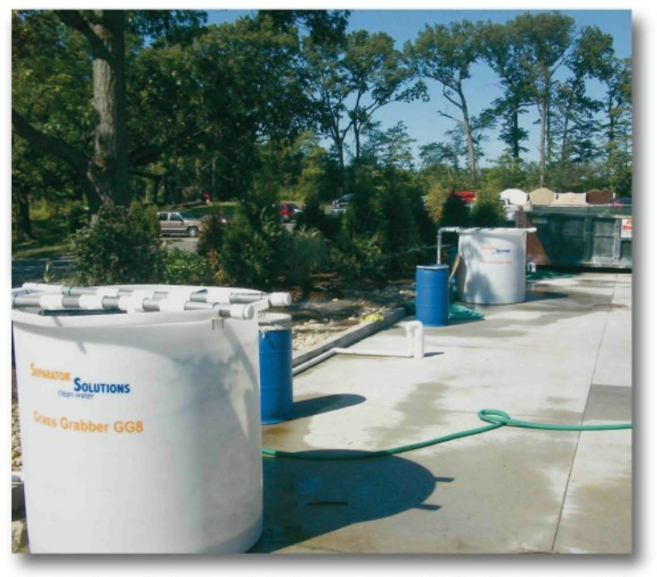
The wash pads drum and basin system at Medinah Country Club. (continued on next page)

and debris. Then the wash water is pumped through another in-line filter and down a rock bed before re-entering Lake Kedijah. The clippings and debris are currently harvested and put into landscape waste containers, but composting this material on-site is an option they intend to explore. Medinah felt that this mechanical system was easier to operate and maintain, because it provides a cost effective alternative to some of the recycled wash pad systems that are currently available.