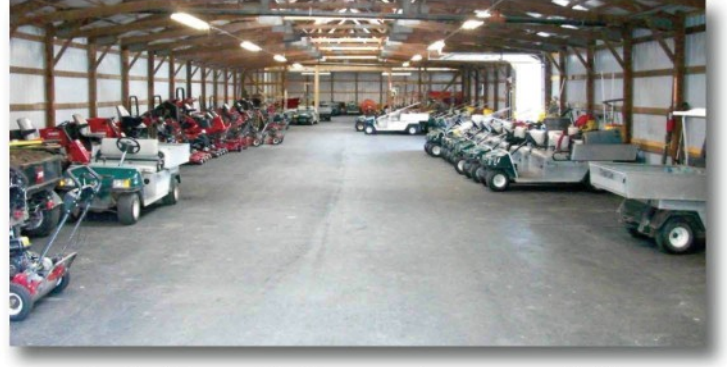
Medinah's new 20,000 square foot storage facility

The former shop and office space is now dedicated to equipment maintenance. There, the staff of four mechanics grind, sharpen, service, weld and otherwise pound away on all that iron to keep equipment running at all three courses.