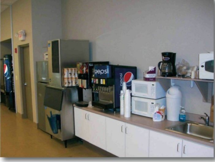
Ice machines, refrigerators, microwaves, soda machines and PLENTY of coffee machines round out the break room