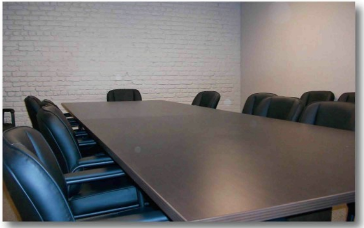
The conference room for staff and member meetings

As you might imagine, Medinah's staff is guite big during the peak golf season. Where, you might ask, do all those people eat lunch, or where do you have morning meetings for all three courses, or where can you communicate at one time with the entire staff? All of those things can happen in their new break room. One of the best features, in my opinion, is a large common area for lunch breaks that has dividers. Each course can have their morning meeting, but the dividers can be pulled back to accommodate the entire staff for lunch or for getting the entire department together. Further, they have a locker room with assigned lockers for each associate.