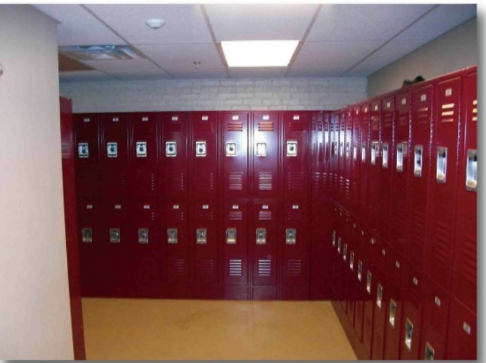
Assigned lockers for each and every one of Medinah's staff

The final price tag for the entire project: permitting, design, demolition, construction. FF&E (furniture, furnishings and equipment), and everything else was $1.8 million. This is a significant savings over other plans that called for the maintenance building to be moved to a completely different site on the property. For those of you in MAGCS looking to renovate, rebuild, or build a new shop, one of the stops you might make on your tour of area facilities is Medinah Country Club. -OC