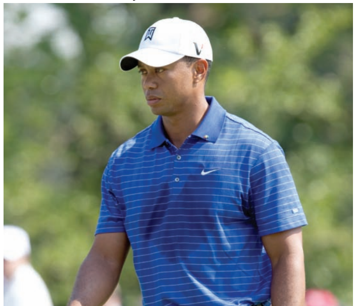
Tiger was sweating on day one. By the end of day three, not so much.