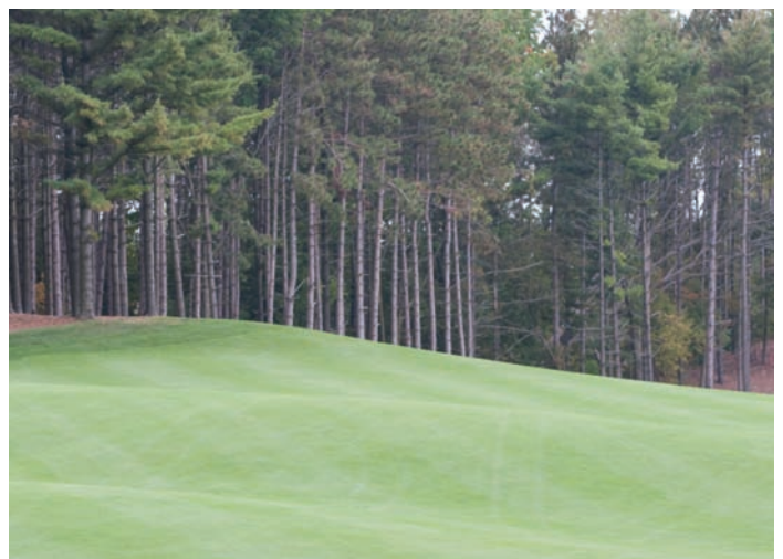
The pines and hills of Pinehills.