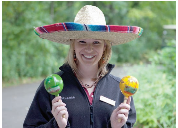
What taco stand is complete with a pair of maracas?