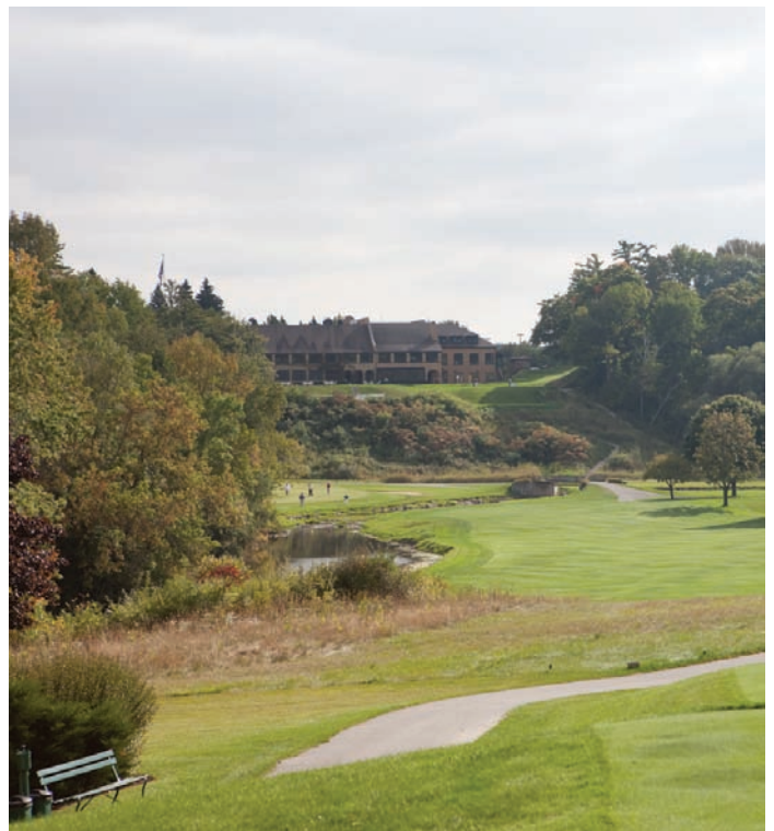
Pine Hills clubhouse over looks the course.