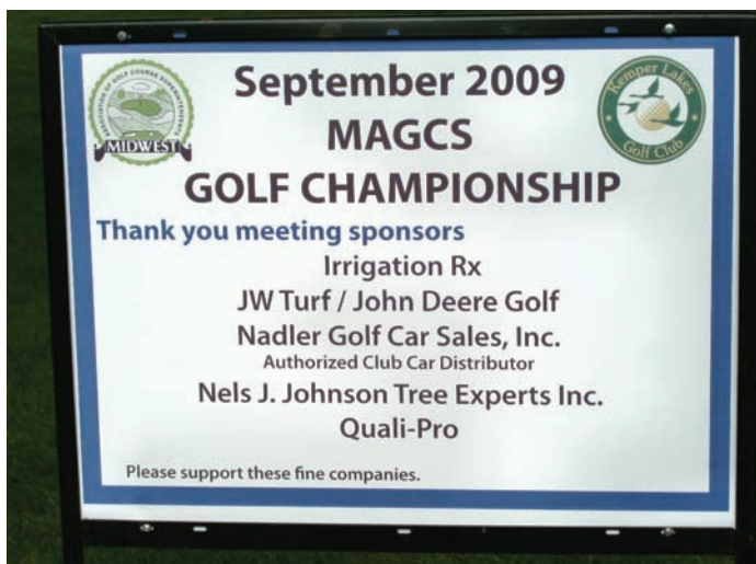
Our generous sponsors.