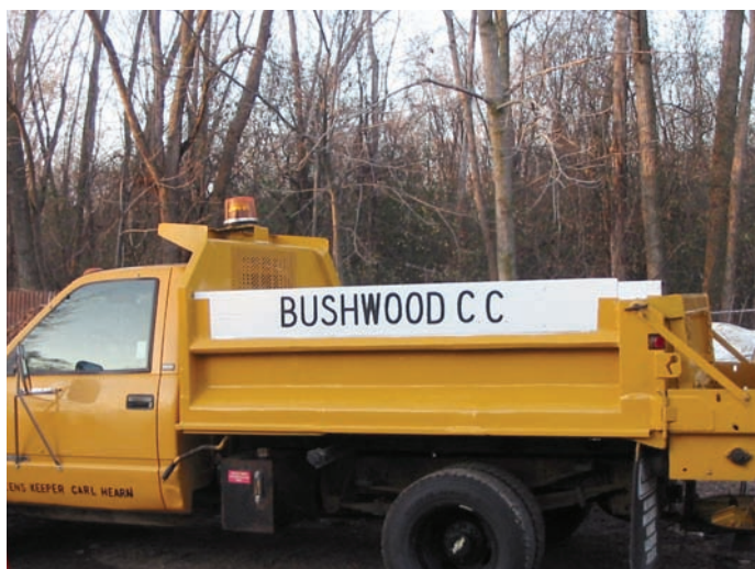
Some guys use city salt trucks to spread lime...