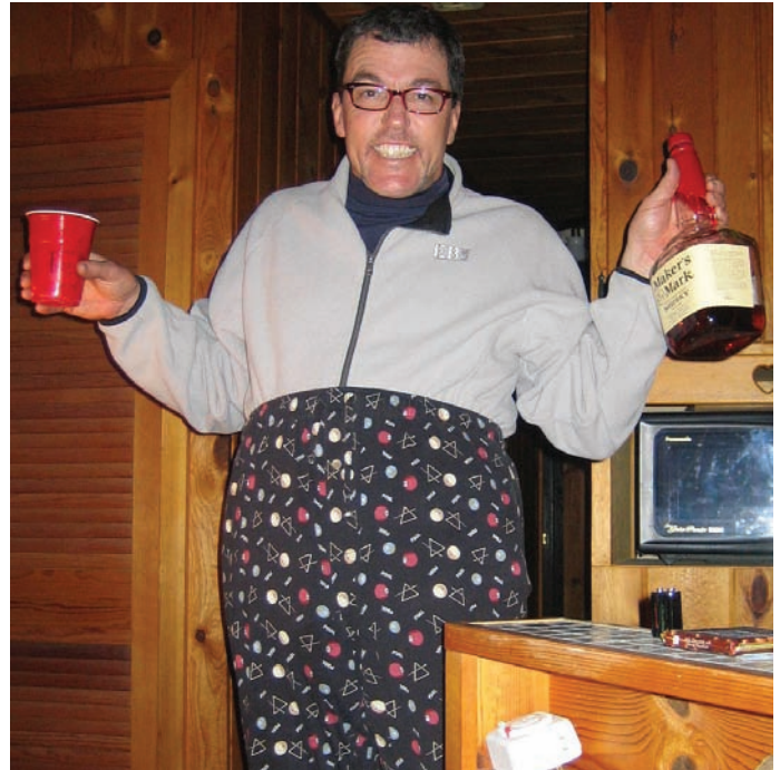
And then there's this—the sad ending to the “What ever happened to Ernie from ‘My Three Sons?’” question.