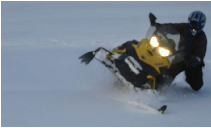
Keith Krause working some major powder