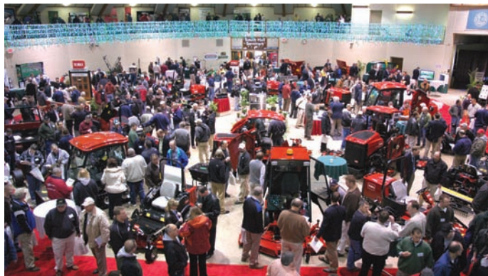
A great turnout for the 19th Reinders Turf & Irrigation Conference

Reinders Wrap-Up—the 19th Reinders Turf & Irrigation Conference took place at the Waukesha Expo center in suburban Milwaukee on March 11th and 12th, with the theme being “Think Green. Be Green. Save Green.” Over 1,500 golf industry professionals were in attendance for the 2-day trade show and educational event, while consuming over 3,000 of the now-famous home-made donuts. The biennial event will take place next on March 9-10, 2011.