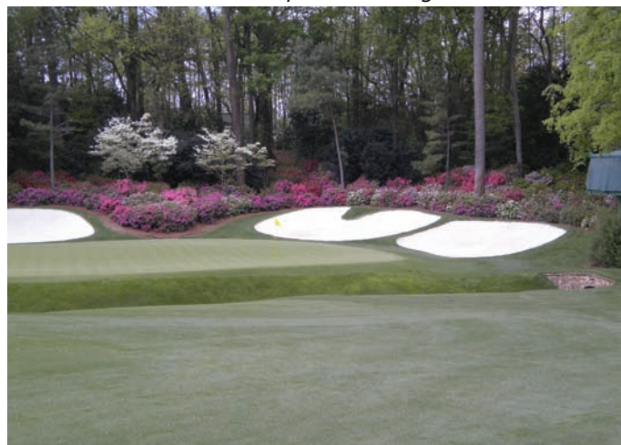
The iconic 13th green in Amen Corner