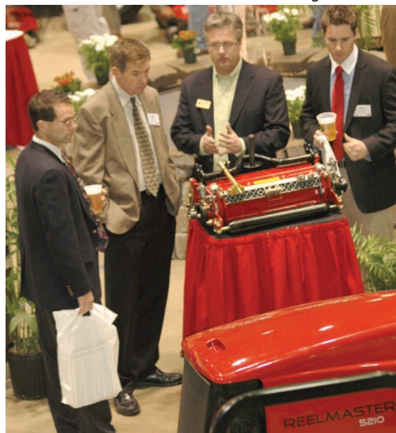
Trade show floors and beer—a Wisconsin tradition!