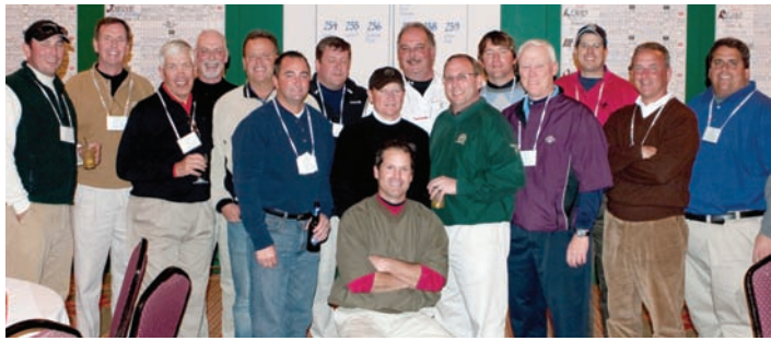
MAGCS is well represented at the National Golf Championship in Gulf Shores, AL.