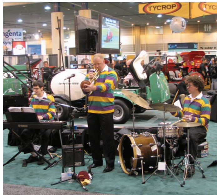
There's more than just iron on the floor—there's brass, too.