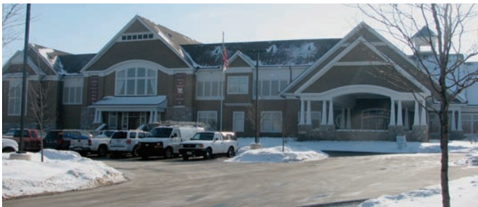
The new and improved Arrowhead Clubhouse.

OK, there was this hurricane that hit New Orleans a while back. It did a lot of bad things, and we all know that story. Thing is, there's still a bunch of messed up stuff down there that needs fixing, and GCSAA along with Habitat For Humanity did a cool thing by helping out and sending volunteers into the messed up areas and pitching in on the rebuilding projects. MAGCS sent a nice contingent of helpers, and only one hurt himself, but not badly.