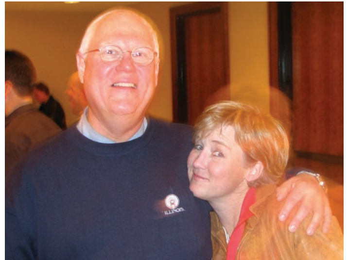
The photographer had obviously been to the bar one too many times by this point.