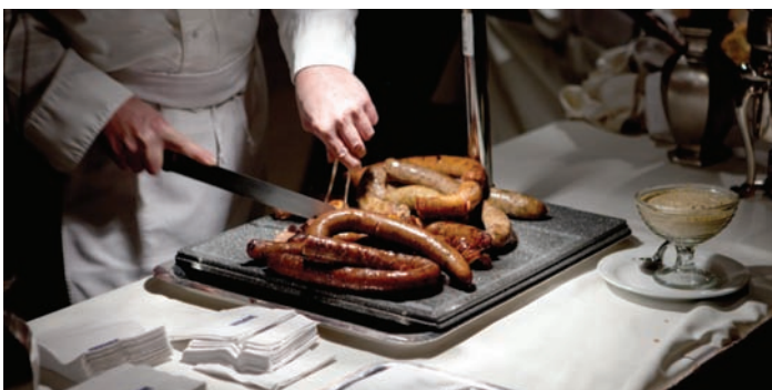
The weird squishy sausage thing, really it is a taste of New Orleans.