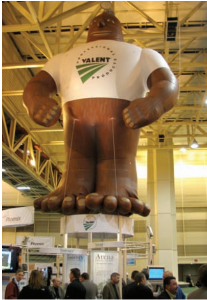
It wouldn't be New Orleans without large inflatable dolls, would it?