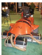
The hit of the floor—the Precision Path robotic mower (though we never got to see one actually move).