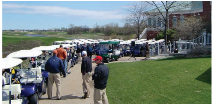
Gentlemen and Ladies: Start Your Engines