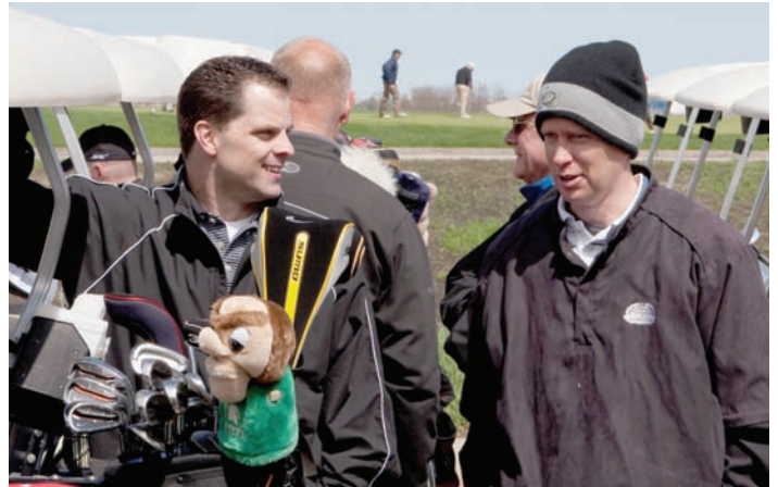
(continued on next page)