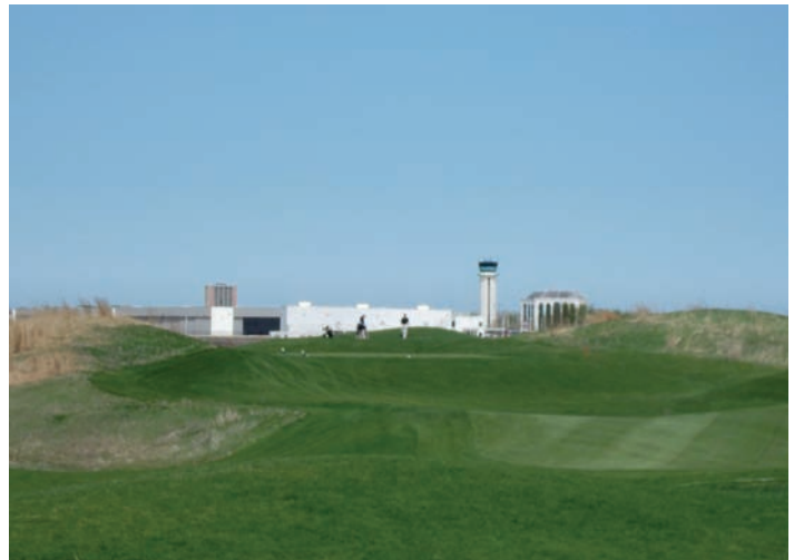
A beautiful day to play golf or fly a plane.