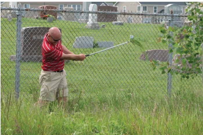
And that cabbage is a golf ball graveyard! Get it? See, there's a graveyard right there...