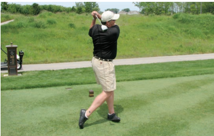
Another tee shot in the cabbage. "you've broken me and I give up" sort of way.