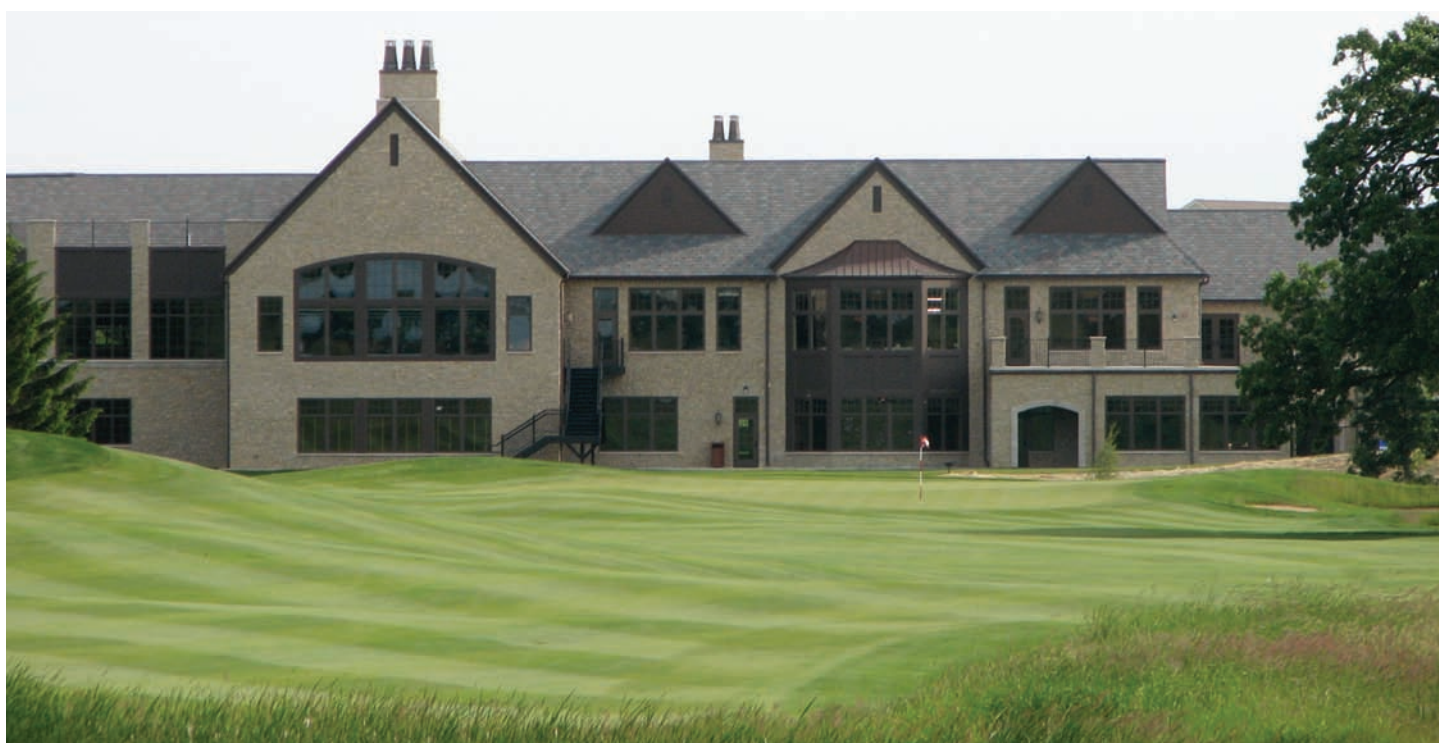
The majestic new clubhouse as viewed from the 18th fairway.