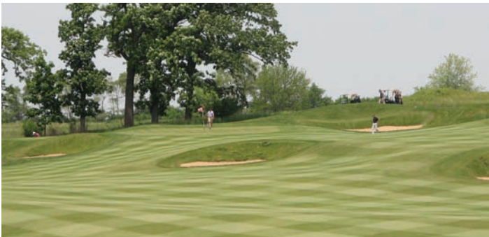
Roly-poly green complexes and undulating terrain were the flavor of the day.