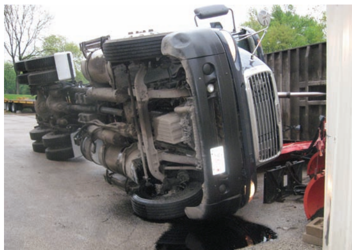
..... Oops! .....