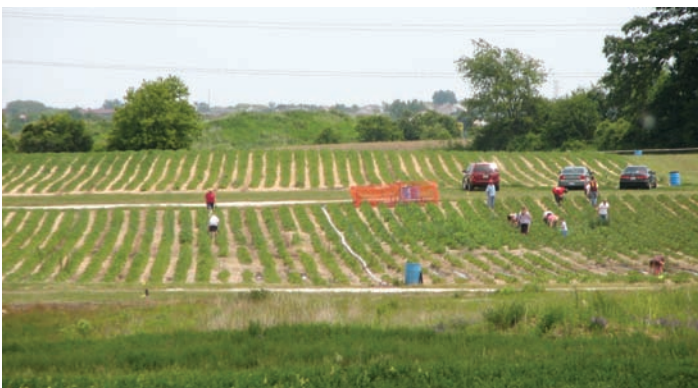
How coincidental that there's a strawberry patch right next door?