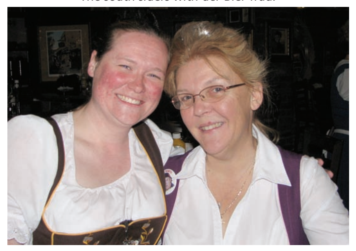
Our wunderbar haus fraus.

Also last month, another big event took place when the Illinois Professional Turfgrass Conference (IPTC) convened at its new location at the Schaumburg Convention Center and Renaissance Hotel (though I'm told Eddie Braunsky showed up at Pheasant Run both days). The 3-day extravaganza featured over 50 excellent education sessions, a trade show with over 90 exhibitors, and ample networking opportunities for the attendees from all areas of the Illinois green industry to avail themselves of. In addition, there were some added bonuses this year, including complimentary lunch on the trade show floor on Thursday, the IPTC Reception on Thursday evening (and the subsequent Bears-Saints game viewed in various locations throughout the hotel), and the Turf Cup Championships that included competitions for great prizes like Nintendo Wiis, Flat screen TV's, and a ton of other raffle prizes and giveaways. The consensus was that the new venue was a big hit, not only from an accessibility standpoint, but from the cool names they had for the meeting rooms. A walk down the hallway revealed rooms with monikers like Nirvana, Utopia, Epiphany, Serenity, Men, and Women—all of which conjure up comforting and relaxing thoughts, huh? This event helped raise funds for research at the University of Illinois, Southern Illinois University, and the Chicago District Golf Association. Thanks to Luke Cella,