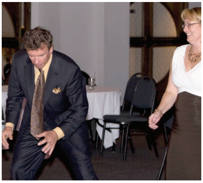
(continued on next page)