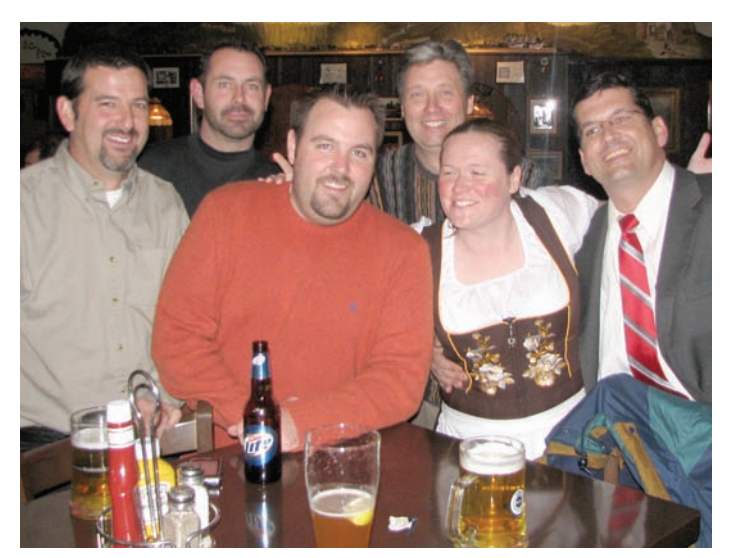
The south siders with der Bier frau.