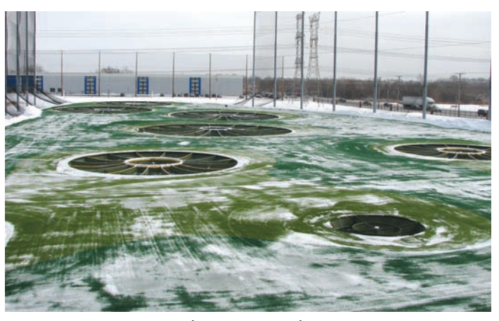
The Frozen Tundra