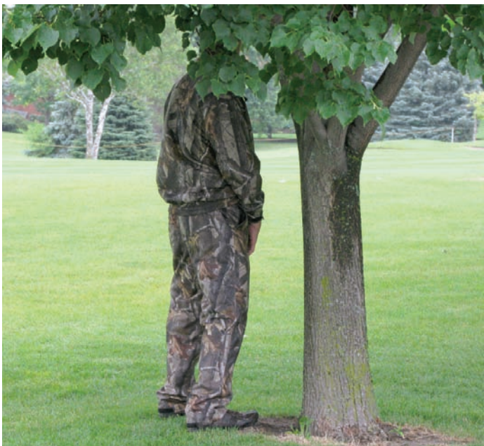
Everyone had trouble seeing this golfer because he forgot his blaze orange cap.