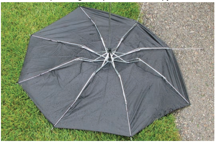
(continued on page 25)