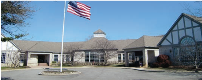
Stately Naperville "Wayne Manor" Country Club.

Club Car Turf II For Sale. Not stolen, but very HOT. This unfortunate utility vehicle ventured too close to a controlled (how ironic) burn of a native prairie last month, and is a good reminder of how intensely hot these fires can burn. The aluminum components of the cart literally melted.