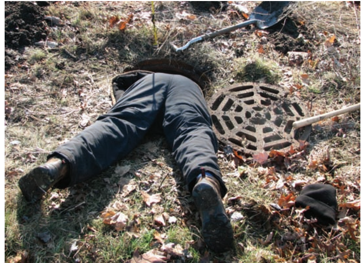
Another glamorous job for the guy who showed up late.

And now that the floodwaters have receded, it's a great time to inspect all those drain lines and catch basins and give 'em a good spring cleaning. Who says we don't have any fun working on a golf course?