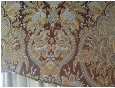
The valance— cut from the same cloth or not?