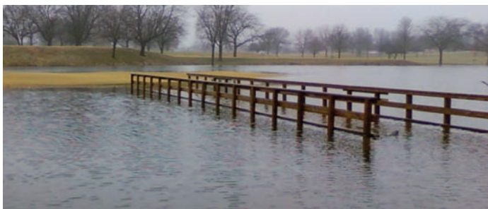
A submerged bridge on a local golf course in March.

Now that we've seen the last of winter with its prolonged ice cover, frigid temperatures, and wild mood swings with thaws and heavy rains causing flooding on many of our properties, we can look back and be thankful that we got through it with minimal damage (hopefully). Widespread reports of severe flooding, fish kills, erosion, and the usual famines and pestilence were popping up everywhere, and I thank the superintendents who shared their photos and stories of the havoc wreaked by Mother Nature on their courses.