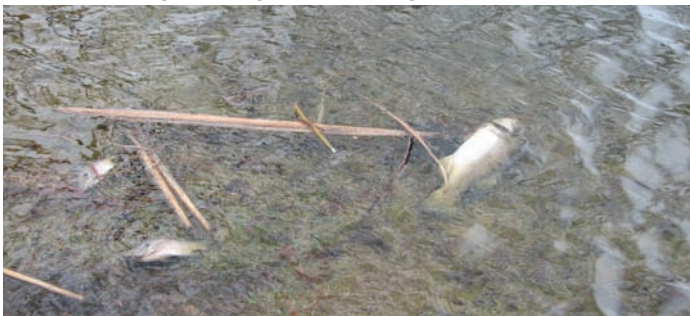
Lack of oxygen under the winter's thick and prolonged ice led to fish kills in many golf course ponds.

And now that the floodwaters have receded, it's a great time to inspect all those drain lines and catch basins and give 'em a good spring cleaning. Who says we don't have any fun working on a golf course?