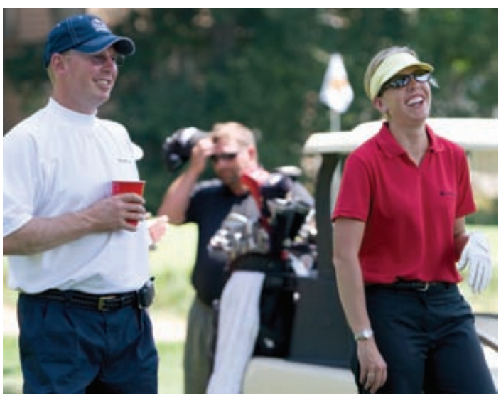
Many laughs and good times were shared at Geneva Golf Club in July.