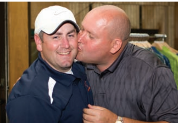
Old friends reunite at Sportsman's.