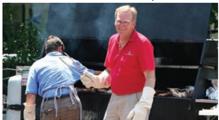
Thanks to Arthur Clesen, Inc for cooking up a great lunch at the scholarship outing.