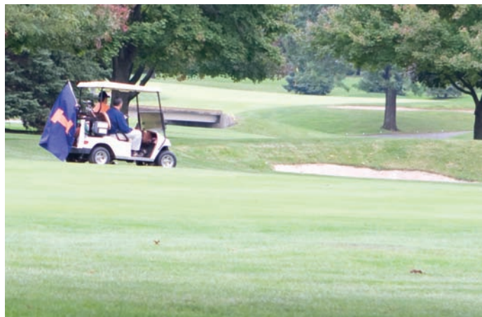
There was only one flag flying at this year's college scramble.