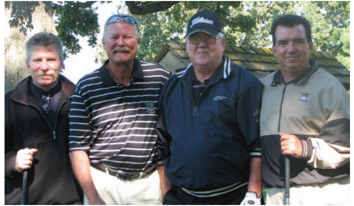
The Old guys...