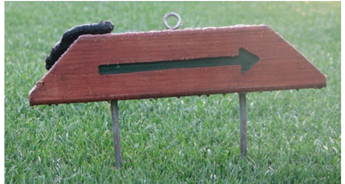
A coyote with uncanny aim, or just a golfer's way of telling you how he feels about your signage?