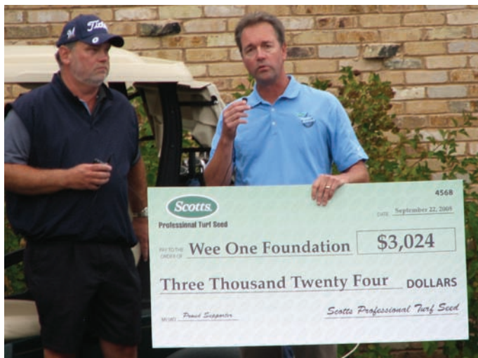
Scott's starts the day off in fine fashion.

could be visited and revisited often), and a really great time was had by all. Congratulations to all who participated and went home with prizes, and thanks to everyone who had a part in putting the day together.