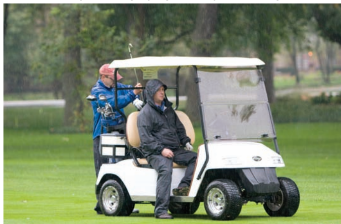
Participants in the college event scrambled to stay dry during the latter holes of play.