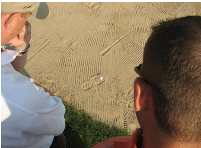
What terrible luck to have not only landed in the footprint but to have plugged as well...