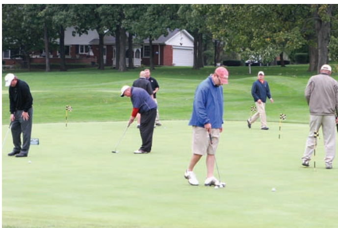
Lots of serious putters, putting around prior to the college scramble at Prestwick Country Club.