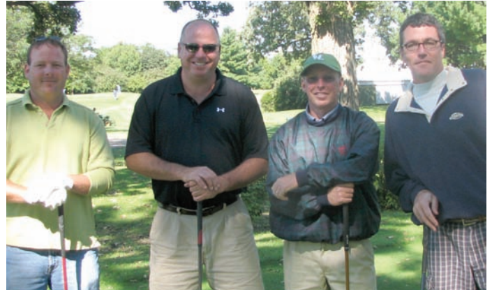
The Young guys...