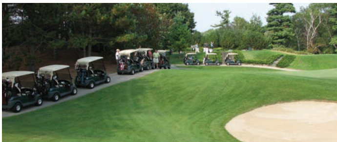
Tough par 3, but a chance to meet folks while waiting.