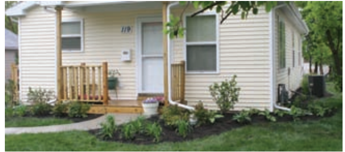
The Habitat House in Aurora landscaped and lived in. Thank you to all the donors especially The Brickman Group for helping this landscaping project.