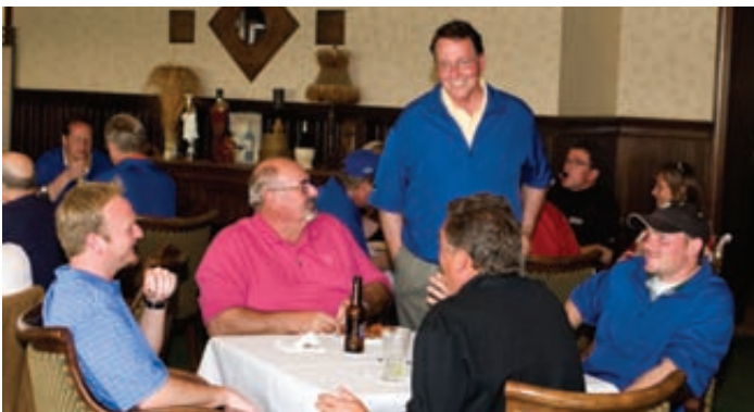
Members of the ITF and MAGCS gather after golf for prizes and cheer.