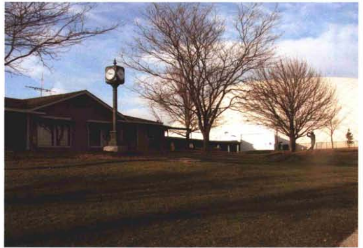
Green Garden's back yard and really nice indoor practice range.