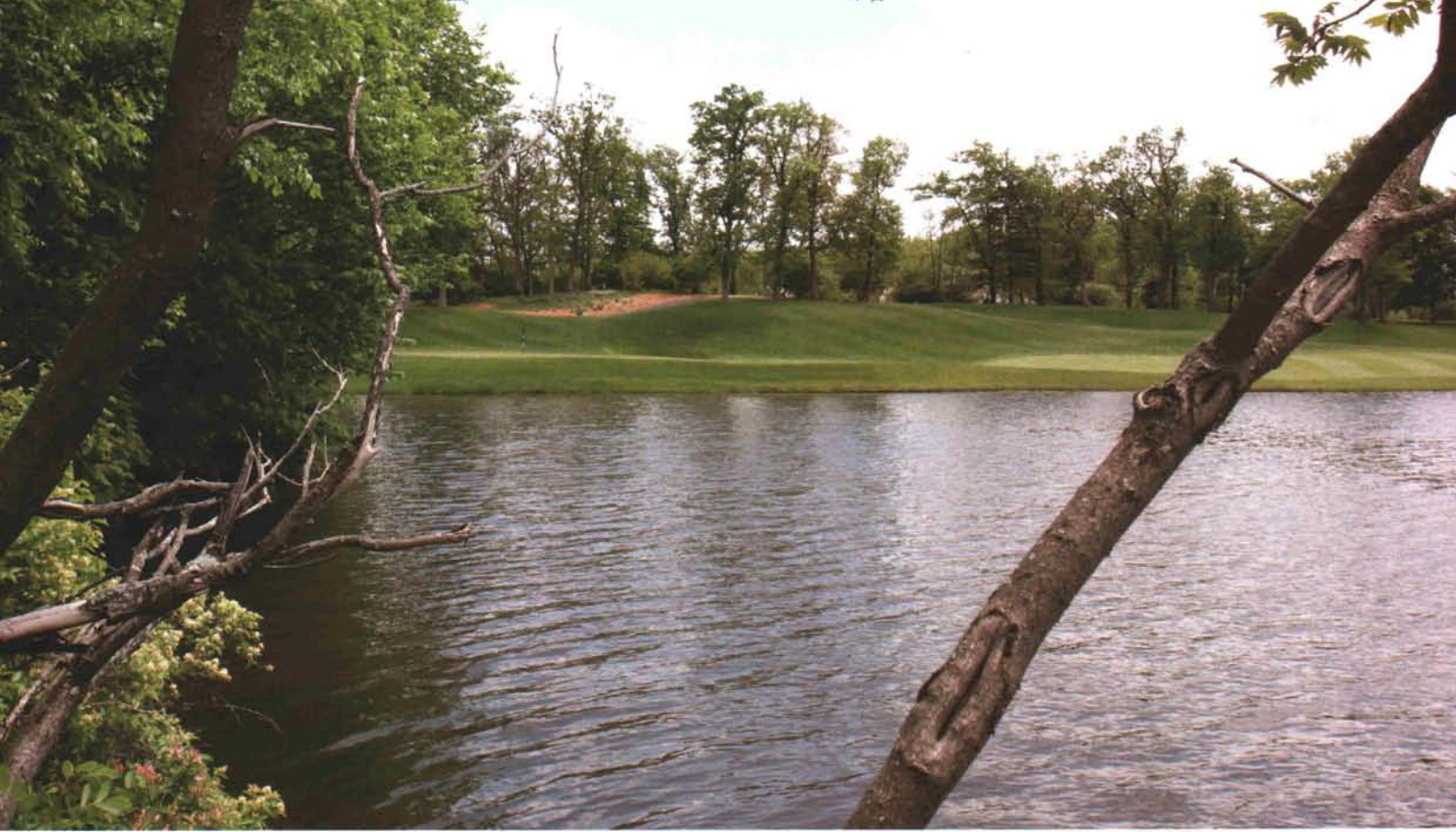
Ivanhoe Club's Forest Ninth, challenges the golfer right from the tee teasing them to go for the green in two.