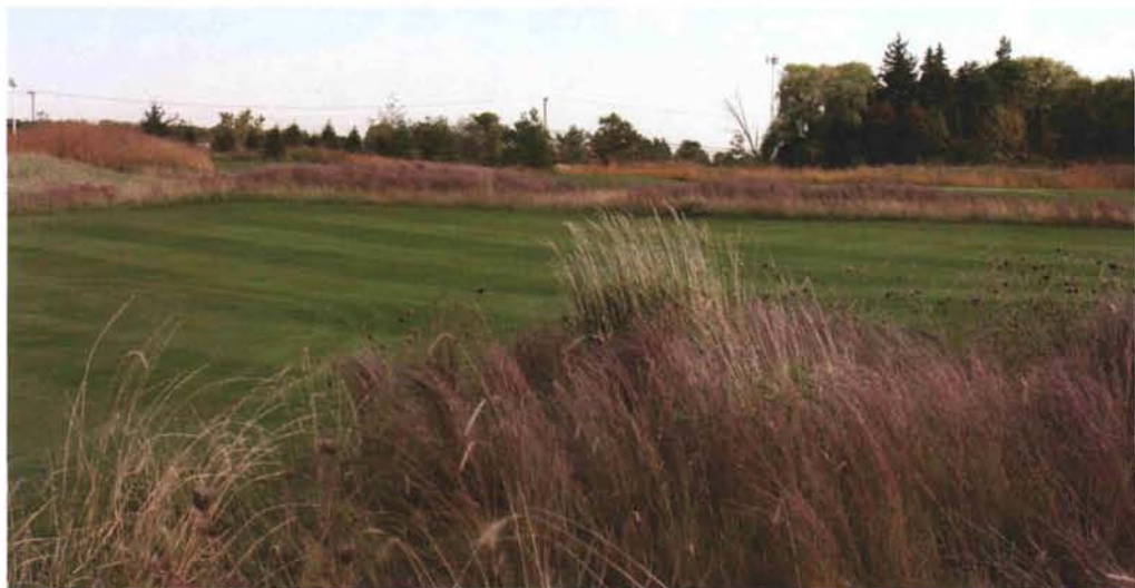
The Ivanhoe's Prairie fairways contrasted by native grasses, forbs and flowers.

The fourth most difficult hole on the golf course, the 443 yard par 4 Marsh #9 requires two solid shots over water to reach this bunkered green.