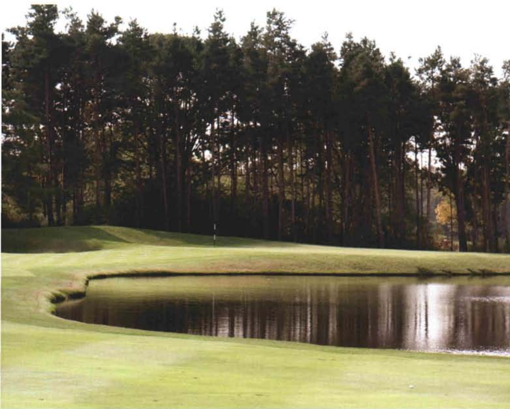
Prairie 7 has the best green complex setting on the course. Large pines frame the hole with water along the right side of the fairway and green.