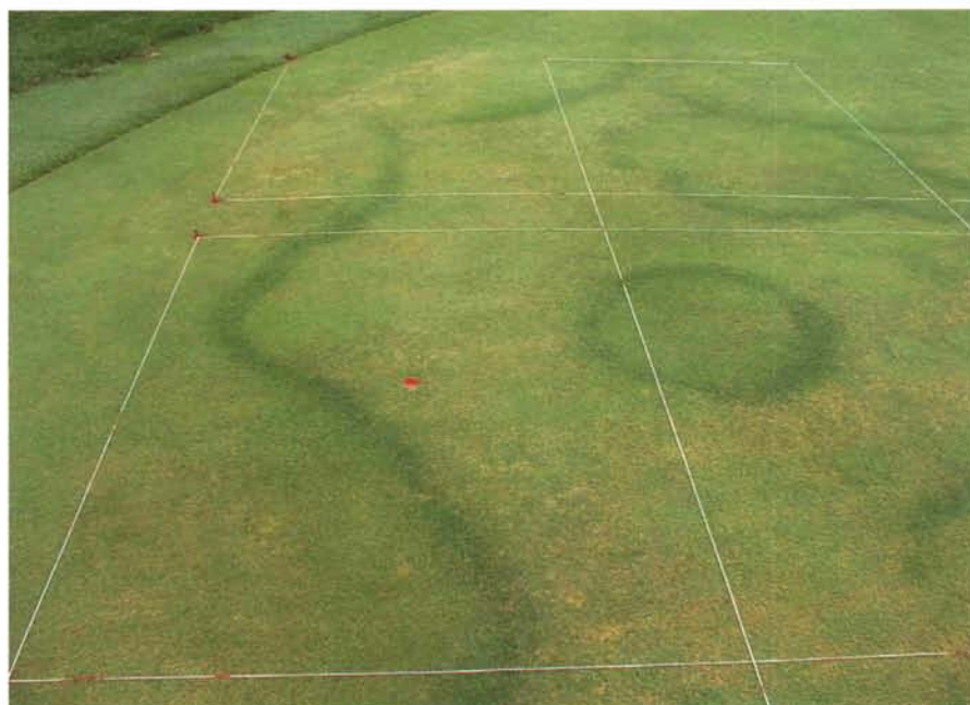
Figure 6. Symptoms of Type II fairy ring within fungicide test plots on a practice putting green, Long grove, IL. taken 10 August, 2006

Surprisingly, fungicides suppressed percent fairy ring per plot only on one date, 31 July. This underscores the difficulty that superintendents can face when addressing an outbreak of fairy ring on greens using preventive timing and the best available products/strategies. Overall, we found multiple fungicides alone and not watered can reduce fairy ring by at least 50% (Figure 7). The addition of Revolution™ with fungicides and watered-in did not improve fungicide efficacy as we had expected at midsummer. However, Revolution™ alone or mixed with fungicides did speed plot recovery of the green using visual ring intensity data (1 to 4 scale, with 4 = highly visible rings). On that date, 28 August, 5% of plot damage still existed in untreated plots and the addition of Revolution™ reduced fairy ring symptom intensity across all treatments by 37% ( P < 0.01 ). Based on Dr. Findanza's research and others, wetting agents/soil surfactants commonly aid the suppression of fairy