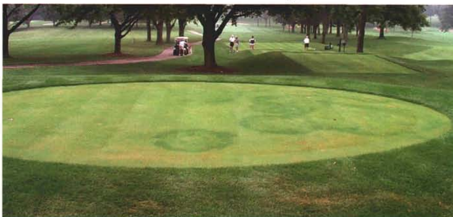
Figure 4. An example of a Type II fairy ring (green rings) on a practice putting green, Long Grove, IL. Photo D. Settle taken 10 August, 2006

In Chicago, fairy ring is an increasing concern for golf course superintendents. The disease is difficult to predict and often more difficult to control. The disease usually peaks midsummer on sand-based putting greens when recuperative potential of cool-season turf is low. Because this disease is caused by multiple soilborne fungi, preventive control with a labeled fungicide is not always guaranteed. The lack of control or ineffectiveness of a fungicide occurs because even distribution of fungicides in the soil is generally difficult to achieve. Excessive thatch can complicate this process as well.