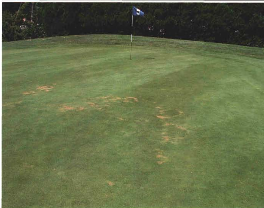
Figure 3. An example of Type I fairy ring (dead rings) on a green in Chicago. taken 31 July, 2006