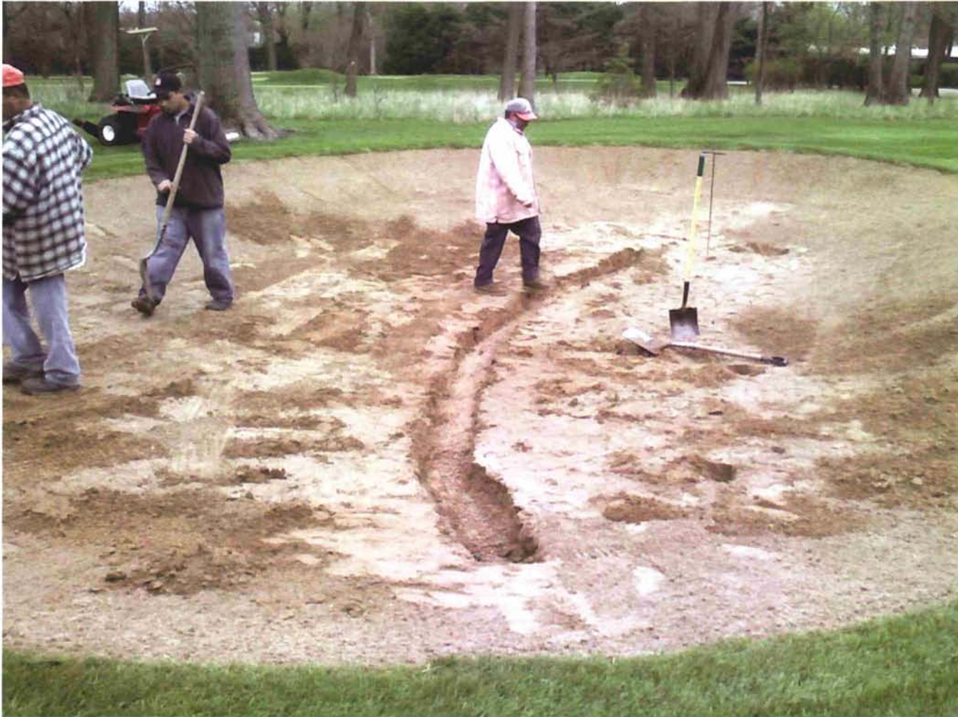
A few of the crew at Indian Hill remove old sand from atop drain lines in a bunker. New sand is used to backfill the trench, increasing the porosity to the tile line, thus increasing overall drainage of the bunker.