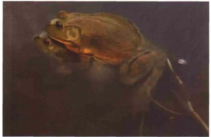
There are two frogs in this image.

This month's gratuitous sex photo—or is this simply a friendly game of leapfrog gone bad? I'm sure there's a nasty reference to the French to be found here, but we won't take that route. Let's leave it at this—there is a bar in Warrenville called the Satisfied Frog. I now know where it got its name.