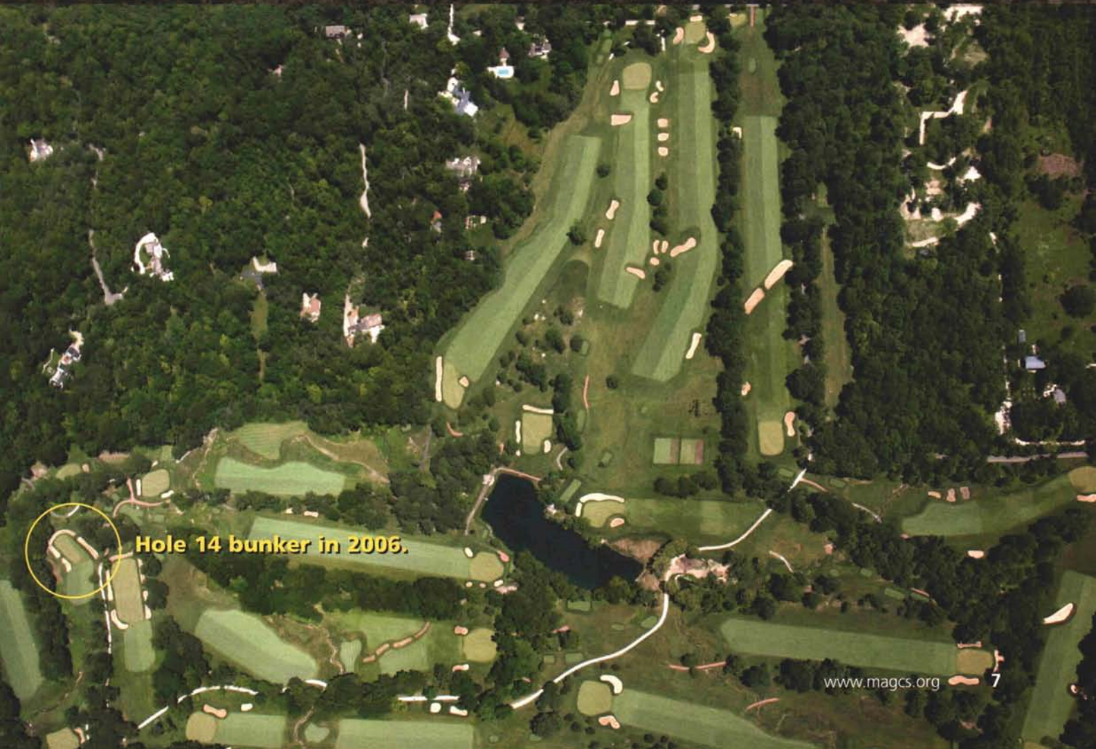
Hole 14 bunker in 2006.