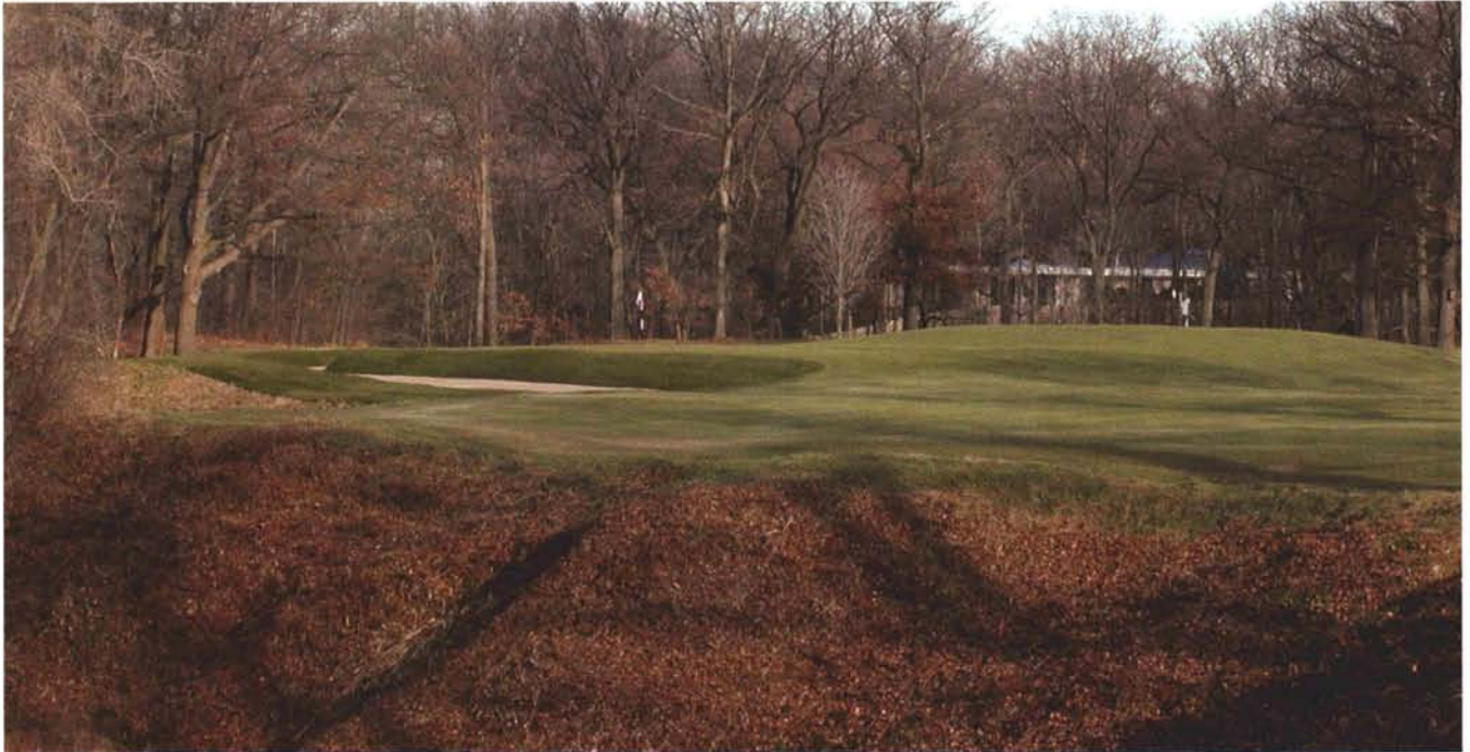
Redan Hole, #14 completed and viewed from the opposite side of the ravine.