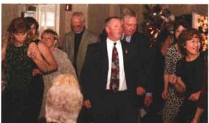
The first official line dance of the night.