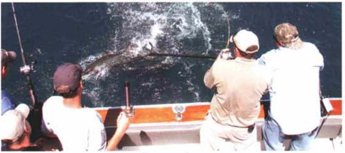
Landing a whopper.