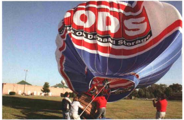
Wrestling with the wind while filling the balloon

"A funny thing happened on my hot-air balloon ride today" – you hear about all the interesting uses (other than golf) that golf courses serve. Our precious tracts of land serve as fireworks display grounds, picnic areas, concerts, fishing havens, late-night nooky venues, and, of course, landing areas for wayward balloonatics. This vessel recently made an unannounced "controlled" crash landing on the grounds of a local country club, proclaiming it "the best and most accommodating place to land ever!" Open space, soft grass, and a forklift were the 3 main reasons for this proclamation. Nobody was hurt, but it surely made for an interesting story to tell later. The folks involved (flying the PODS balloon from Lisle as part of a huge flotilla of big balloons to launch) were kind enough to share their photos of their exciting day.