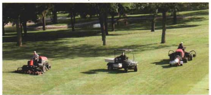
A disbelieving crew watches and waits for the landing