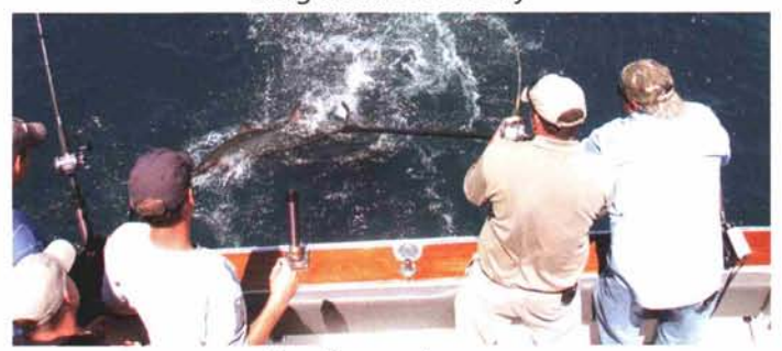
Landing a whopper.