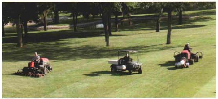
A disbelieving crew watches and waits for the landing