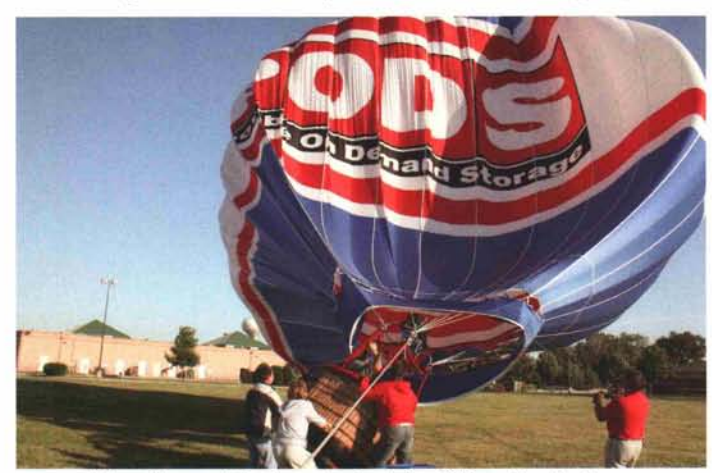
Wrestling with the wind while filling the balloon

"A funny thing happened on my hot-air balloon ride today" – you hear about all the interesting uses (other than golf) that golf courses serve. Our precious tracts of land serve as fireworks display grounds, picnic areas, concerts, fishing havens, late-night nooky venues, and, of course, landing areas for wayward balloonatics. This vessel recently made an unannounced "controlled" crash landing on the grounds of a local country club, proclaiming it "the best and most accommodating place to land ever!" Open space, soft grass, and a forklift were the 3 main reasons for this proclamation. Nobody was hurt, but it surely made for an interesting story to tell later. The folks involved (flying the PODS balloon from Lisle as part of a huge flotilla of big balloons to launch) were kind enough to share their photos of their exciting day.