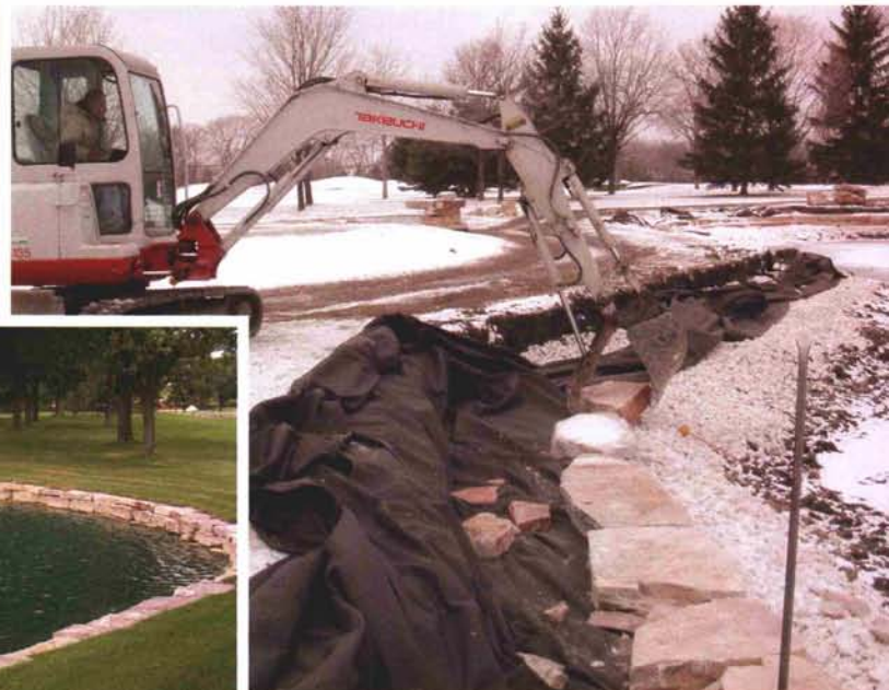
Outcropping stone is dry stacked along the pond bank.