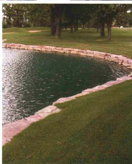
After backfill and sod the new pond banks are very impressive and highly functional.