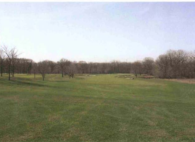
AFTER Down the 4th hole