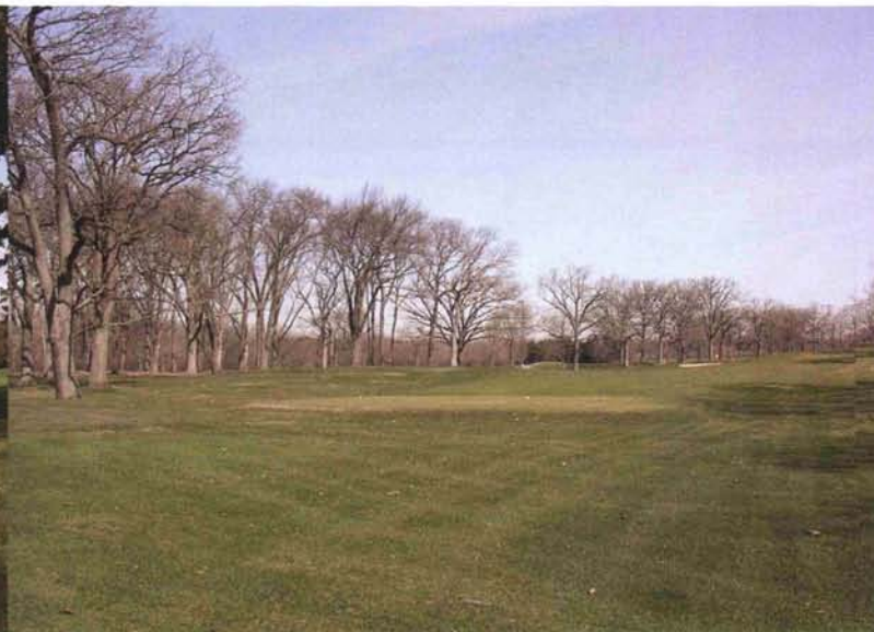
AFTER No woods looking from 6 tee toward 7 green