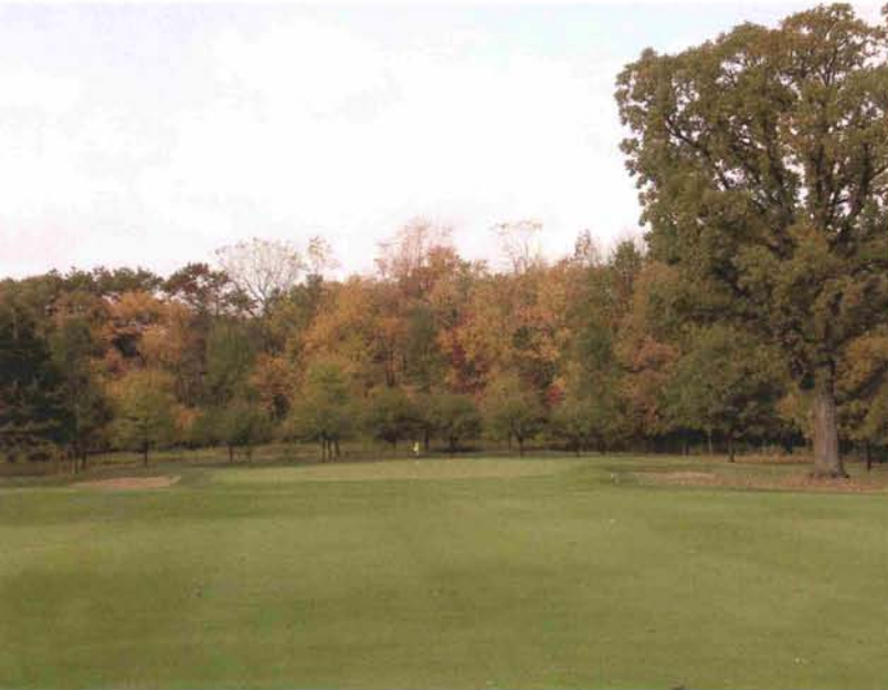
BEFORE Crabs and other trees behind the 1st green