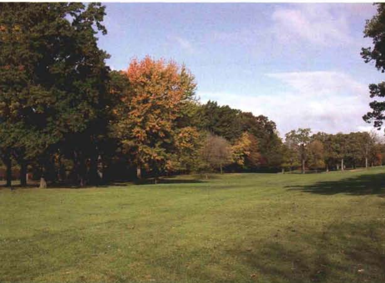
BEFORE Looking from 6 tee toward 7 green, notice the woods