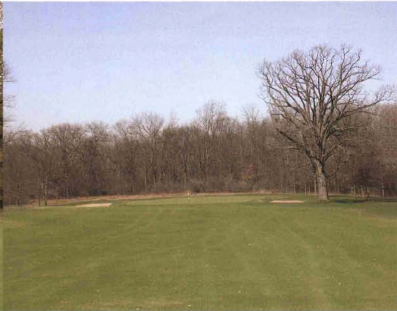
AFTER No trees behind the 1st green