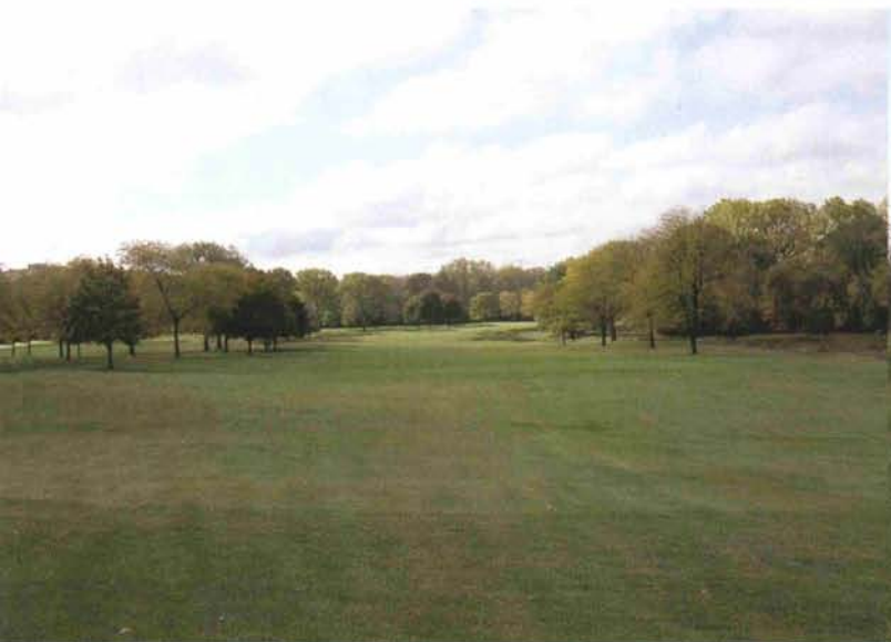
BEFORE Looking down the 4th fairway