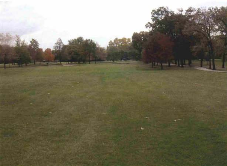
BEFORE Looking down 15th hole