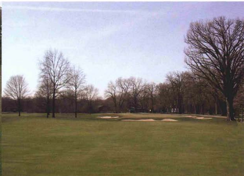
AFTER Down the 15th hole