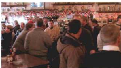
The cozy Bier Stube, packed with holiday revelers.

..... It was nice seeing the sizable turnouts at the two big holiday parties offered around town last month. The South Side Superintendents' Party was held on Monday, December 5 at its usual haunt, the Bier Stube in Frankfort. A full house enjoyed all the trappings of a German holiday celebration, including a plateful of varying sizes and colors of sausages.