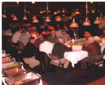
The crowd at Dave & Buster's enjoying lunch.

enjoyed the Italian lunch spread, followed by some very competitive billiards and other gaming options.