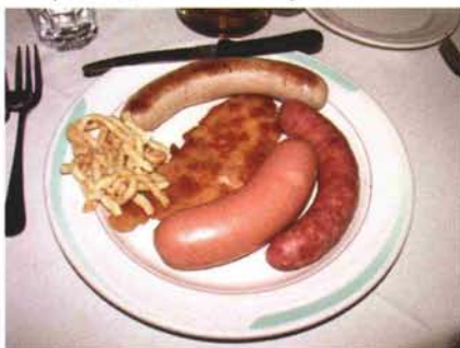
Lunch Bier Stube-style.

Just a week later, the West Side Superintendents' Party was held at its normal venue—Dave & Buster's in Addison. Another large crowd