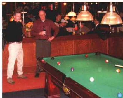
No West Side party would be complete without a few games of pool.