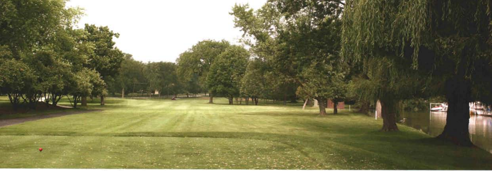
The first hole at McHenry CC from the tee. The water on the right is the Fox River.