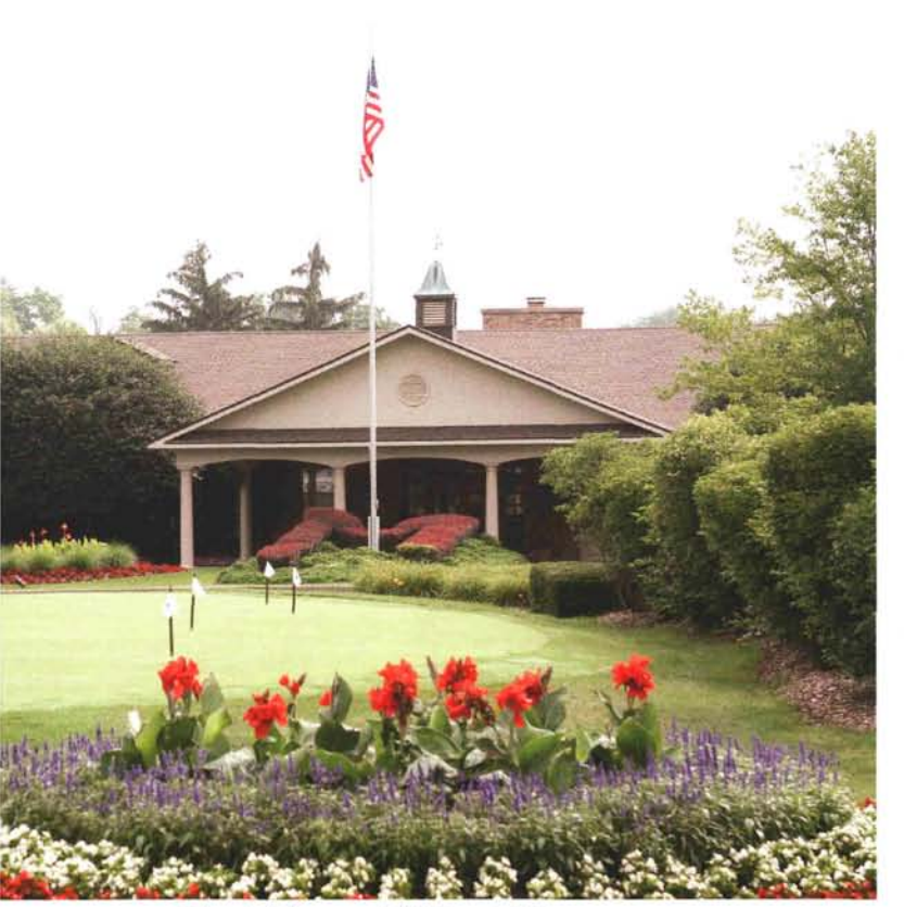
The clubhouse at McHenry CC.

In 1922 a fine country club was established with nine holes that overlooked the Fox River in McHenry, IL. Construction on the second nine holes began in 1925 and in 1926, a regulation 18-hole facility was presented to the membership for their enjoyment and leisure. The course was played in original form until 1953 when major renovations brought the lengthening of several holes, numerous tree plantings, bunker renovations and improved greens. The club has since remained virtually unchanged except for aesthetic improvements around tee and green complexes.