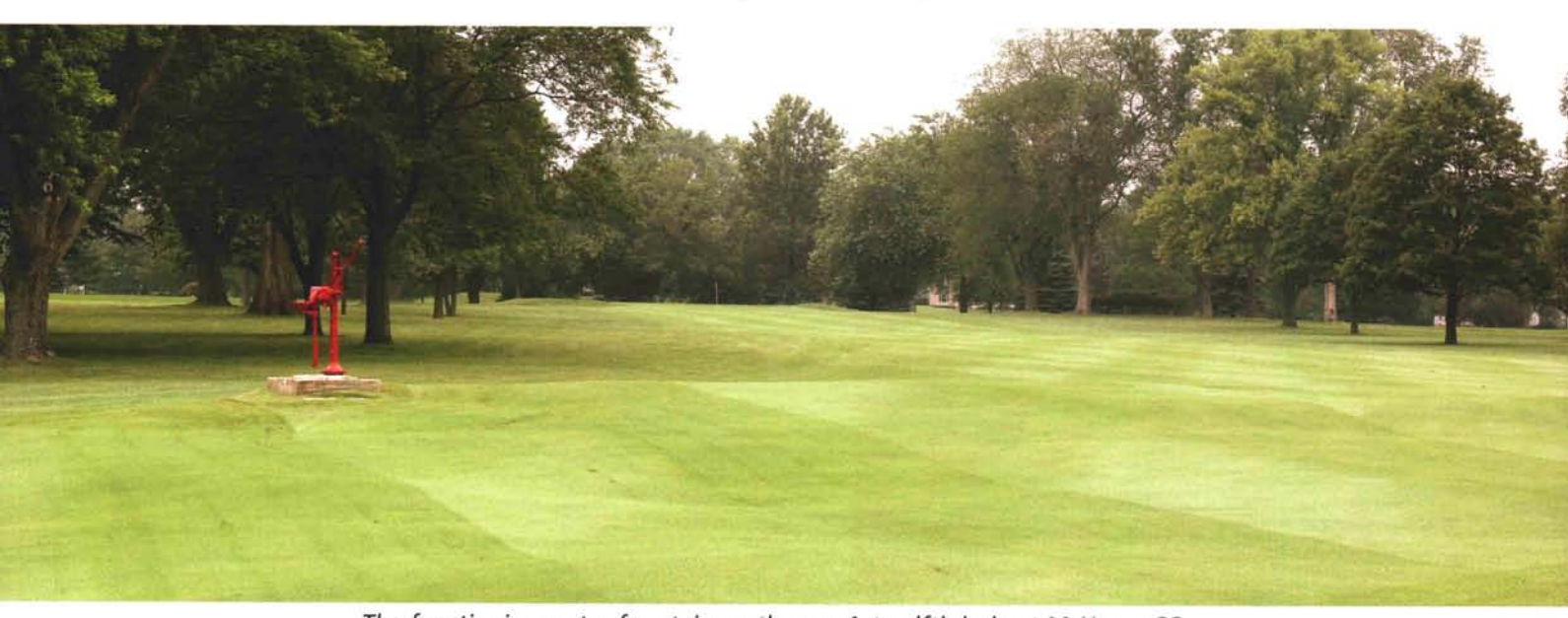
The functioning water fountain on the par 4, twelfth hole at McHenry CC.