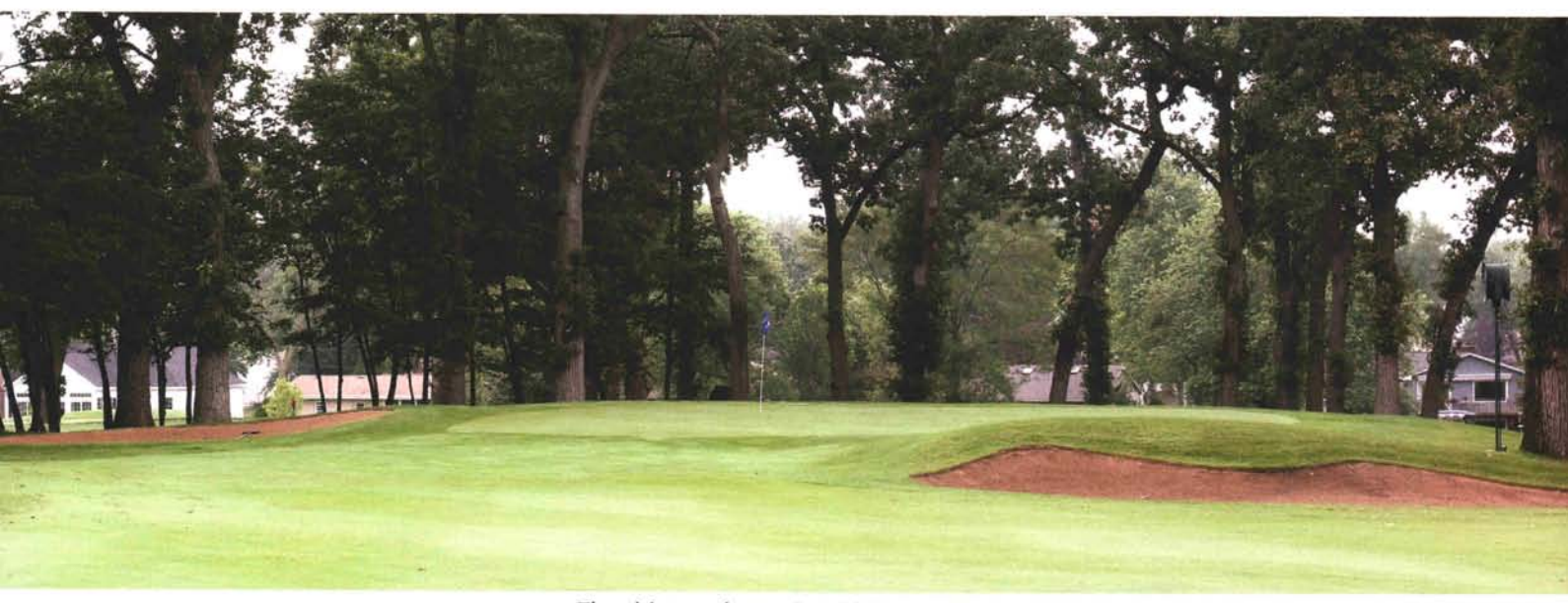
The thirteenth par 4 at McHenry CC.