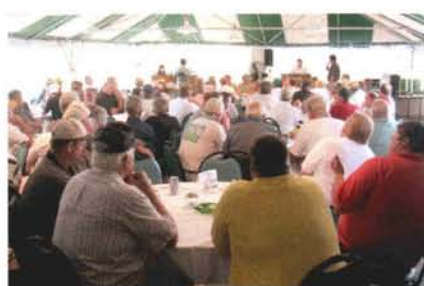
All eyes glued to their MANY raffle tickets.