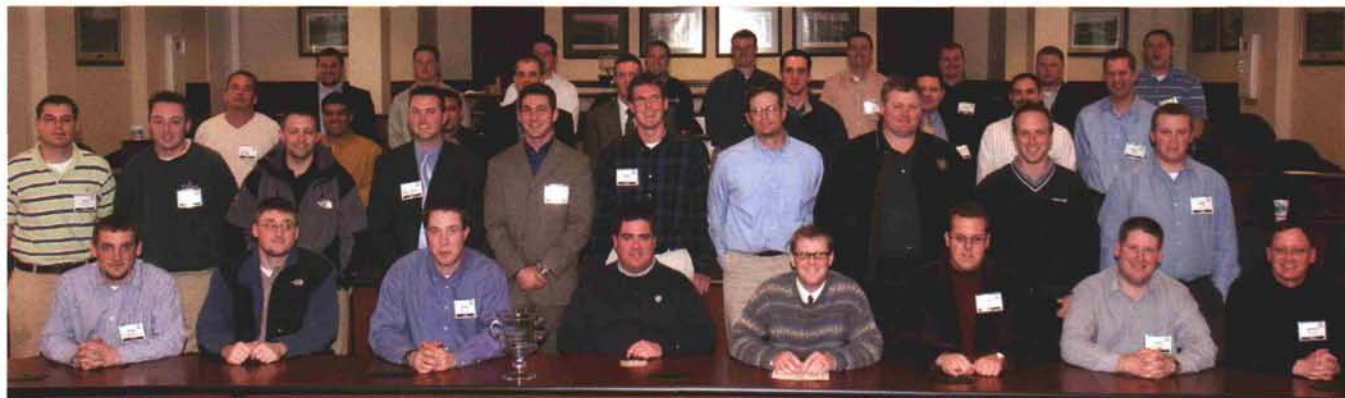
MAGCS 3rd Annual Assistant Winter Workshop Attendees