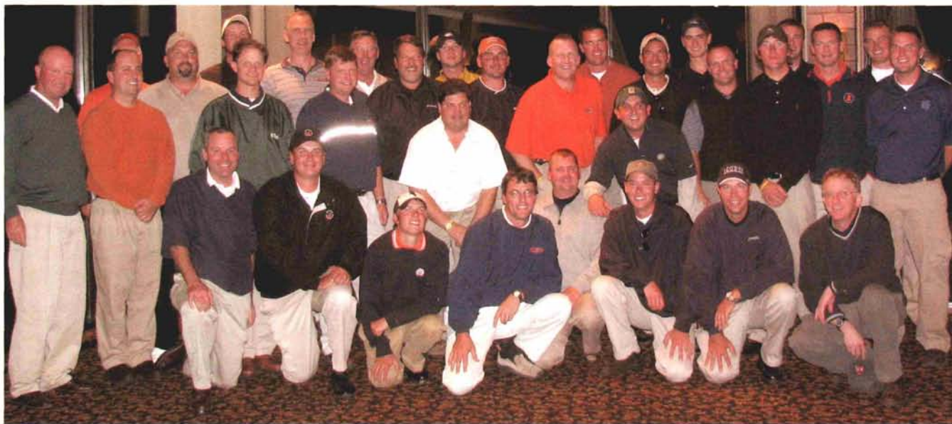
This year's group of U of I alums.