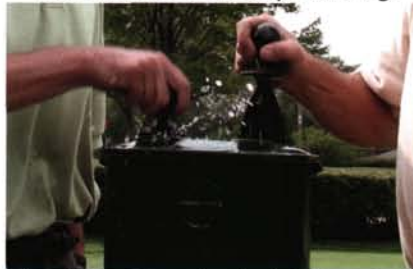
Thank God for the dual ballwashers, without which it would have been a seven-hour round!