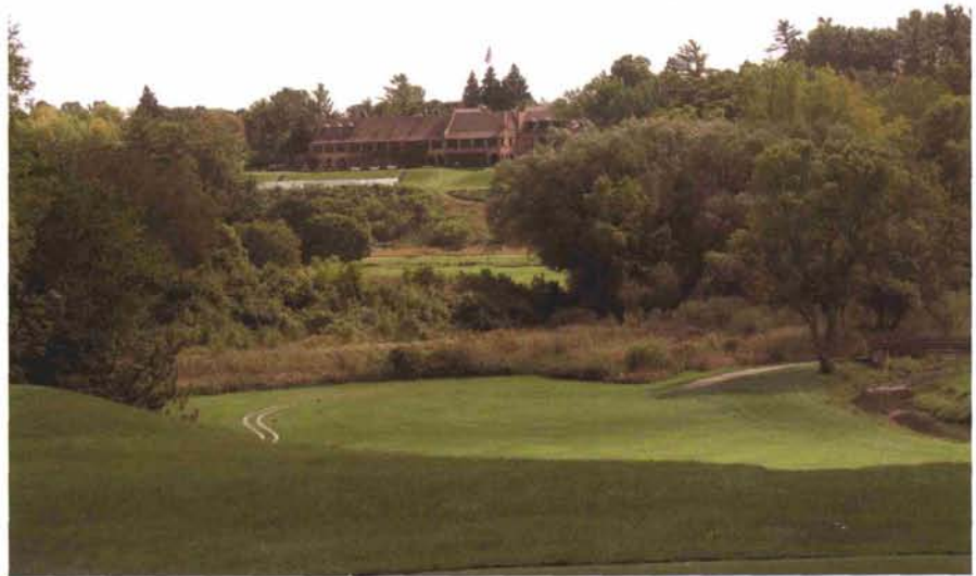
The picturesque clubhouse and rolling terrain of Pine Hills Country Club.