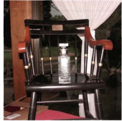
The winner's booty.