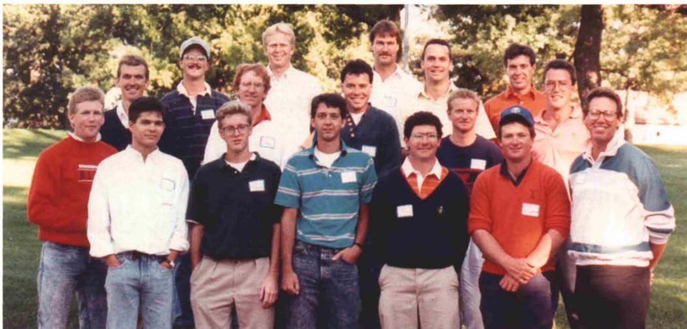
And many of those same people back in 1988 at Bartlett Hills—thinner and less bald.