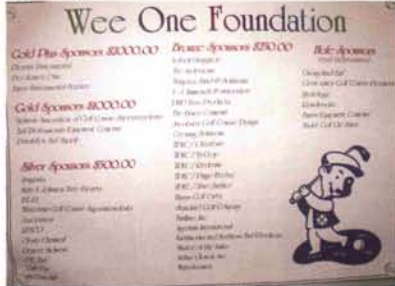
The Wee One Foundation benefactors.