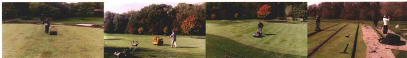
(L to R) First rolling after laying sod; second rolling one week later; first mowing 10 days after sodding; TDI installing drain lines in spring 2004.