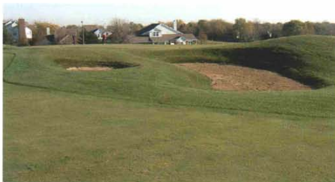
Greenside bunker at Golf Club of Illinois, post renovation.