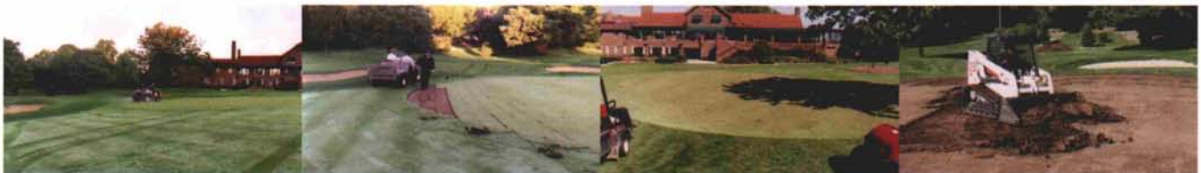
(L to R) Applying fertilizer and fungicide to existing green prior to removal of sod; removing sod from green; the green sod laid down just as it came off the green directly behind green complex on the clubhouse lawn; excavator removing 4" topdressing layer.