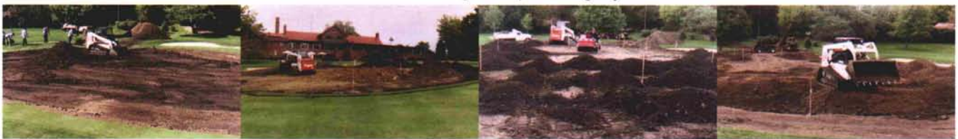
(L to R) Excavator removing 8" topsoil layer; excavator shaping green with fill brought in to reduce slope of green; hauling old topsoil mix back into green after fill had been added to reduce slope; hauling in old topdressing mix to go on top of old topsoil mix.